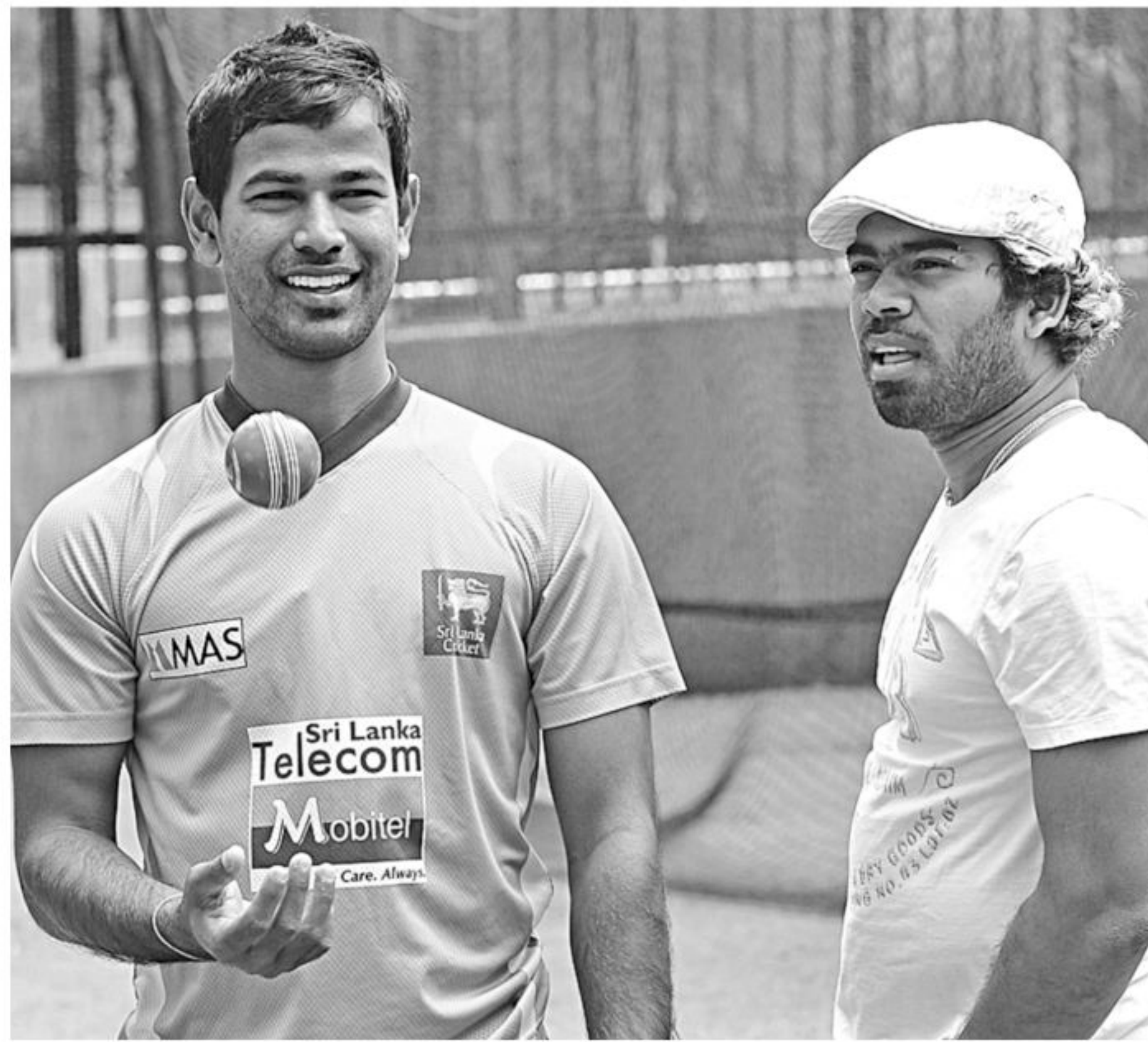
Sri Lanka's Nuwan Kulasekara (L) and Lasith Malinga chat during a practice session in Melbourne yesterday. The second Test between Australia and Sri Lanka starts at the Melbourne Cricket Ground today.

Australia lead the three-match series 1-0, with the third Test scheduled to begin in Sydney on January 3.