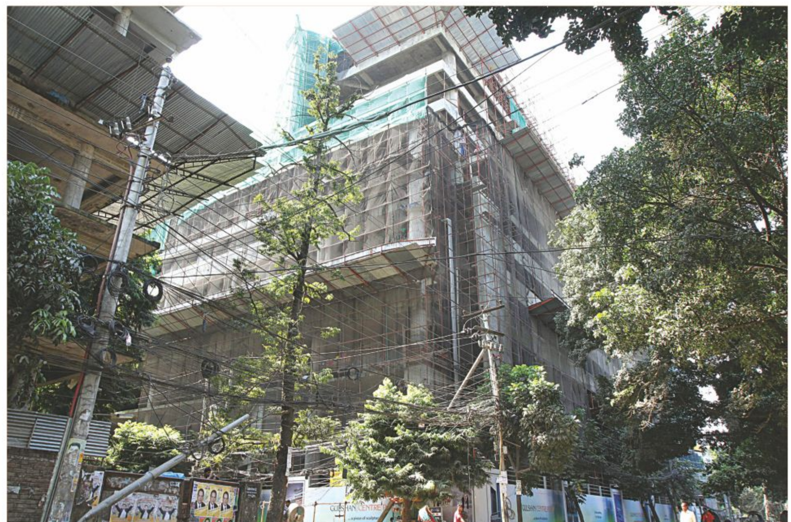
These two commercial highrises are being constructed by the city corporation on Rajuk's land in Gulshan, left, and Banani, right, without any authorisation. The photos were taken in October.

The city corporation is constructing two commercial highrises on the land owned by Rajuk and earmarked for open car parks and other public facilities in the capital's Gulshan and Banani. It has signed property-sharing contracts with Borak Real Estate Ltd for the 30-storey Banani Super Market and United City Twin Tower Development Ltd for the 26-storey Gulshan Centre Point. The works are almost complete without approval from Rajdhani Unnayan Kartripakkha (Rajuk), the environment department and the civil aviation authority. "In one word, these are all illegal [as per Building Construction Act and Town Improvement Act]," said