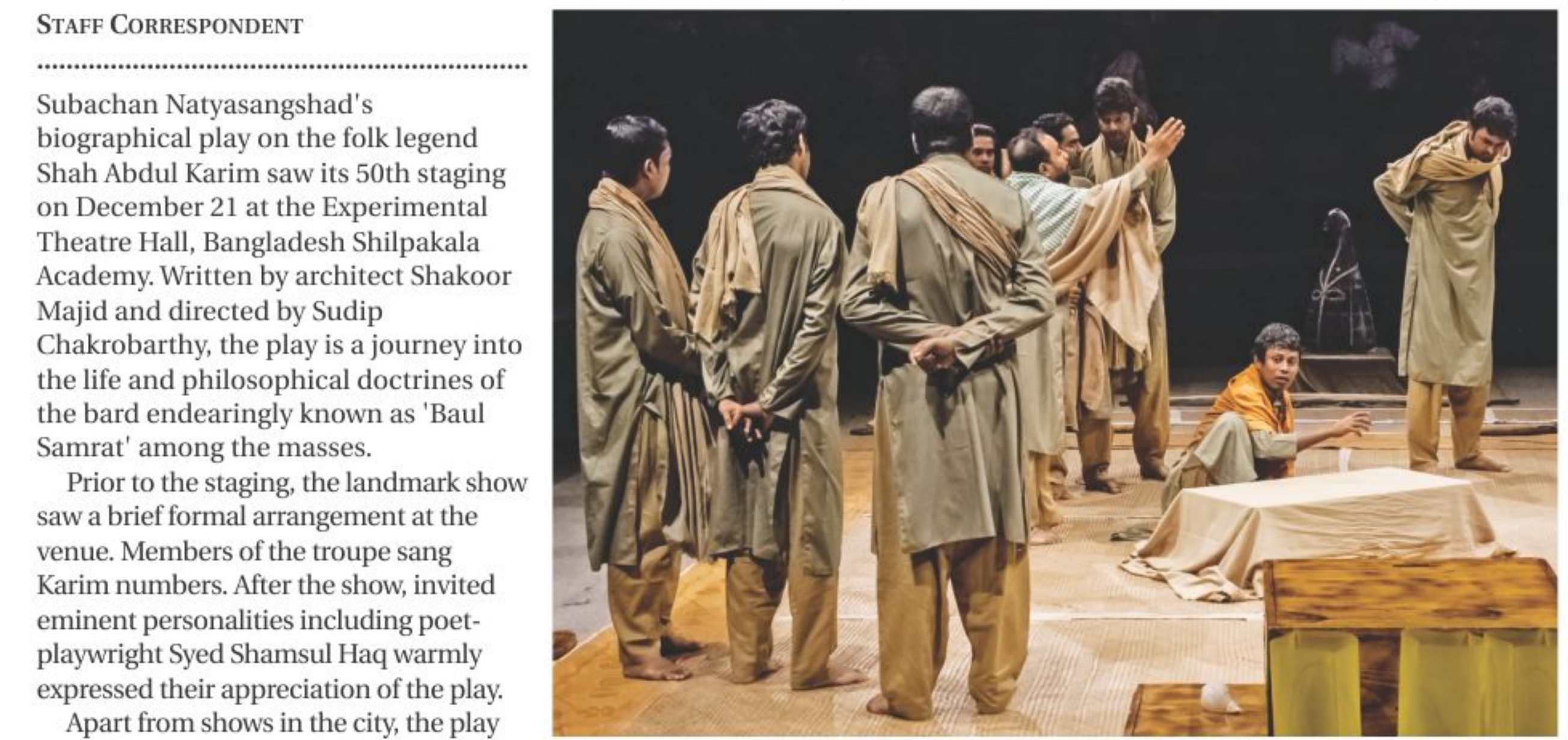
A scene from Mahajoner Nao.