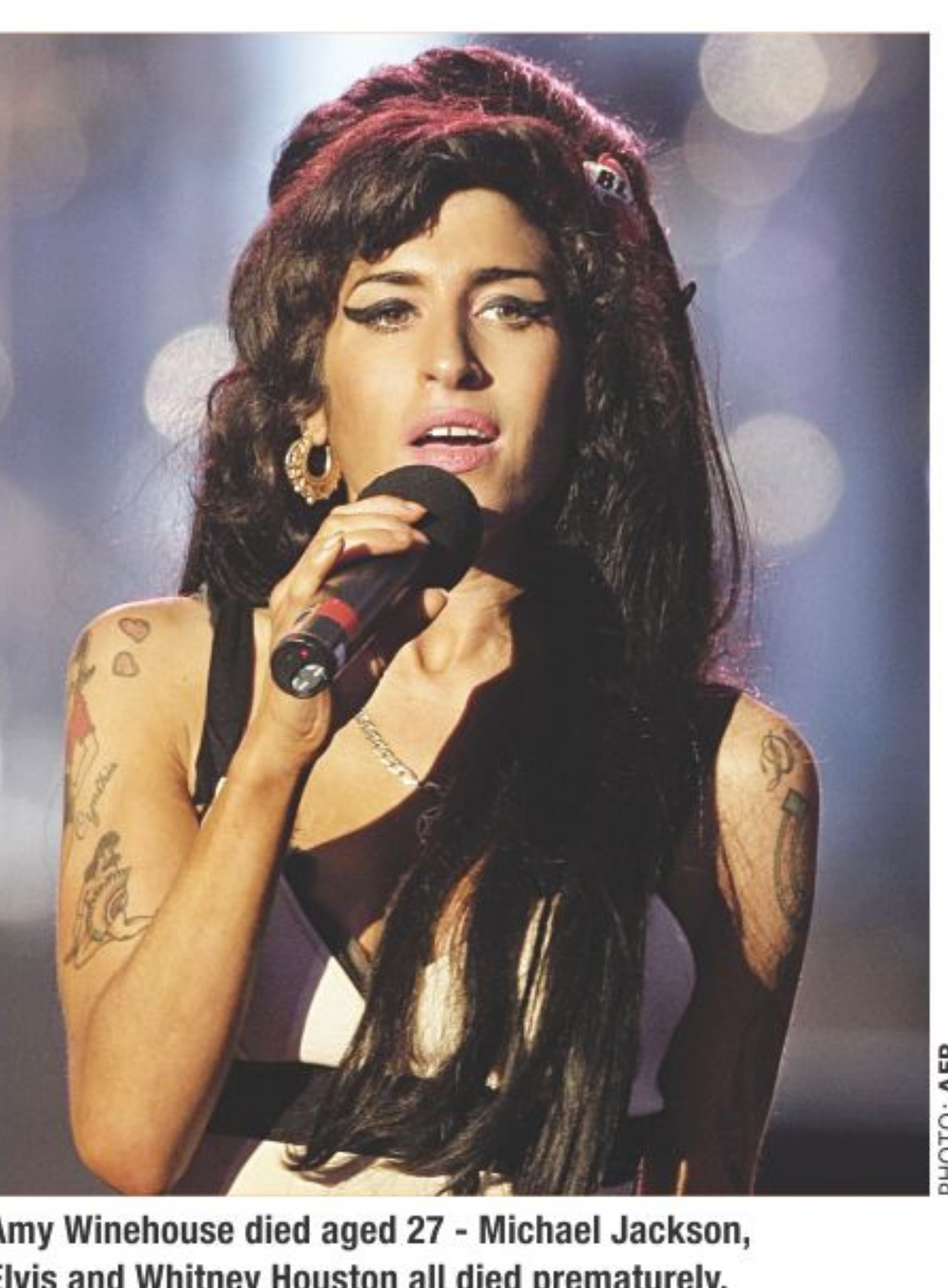
Amy Winehouse died aged 27 - Michael Jackson, Elvis and Whitney Houston all died prematurely.