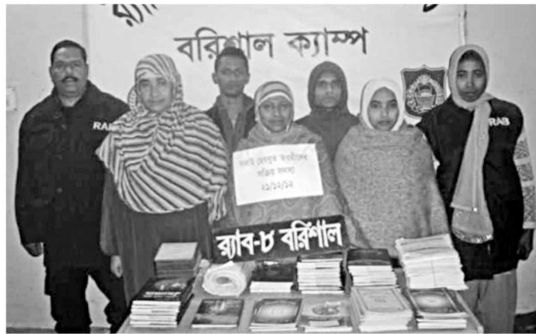
Five Hizb-ut Tawhid activists, arrested with books, leaflets, VCDs and DVDs on jihad from Rupatoli bus stand in Barisal city early yesterday, line up at Rab Barisal camp-8.

The opera has already been shut, he added.