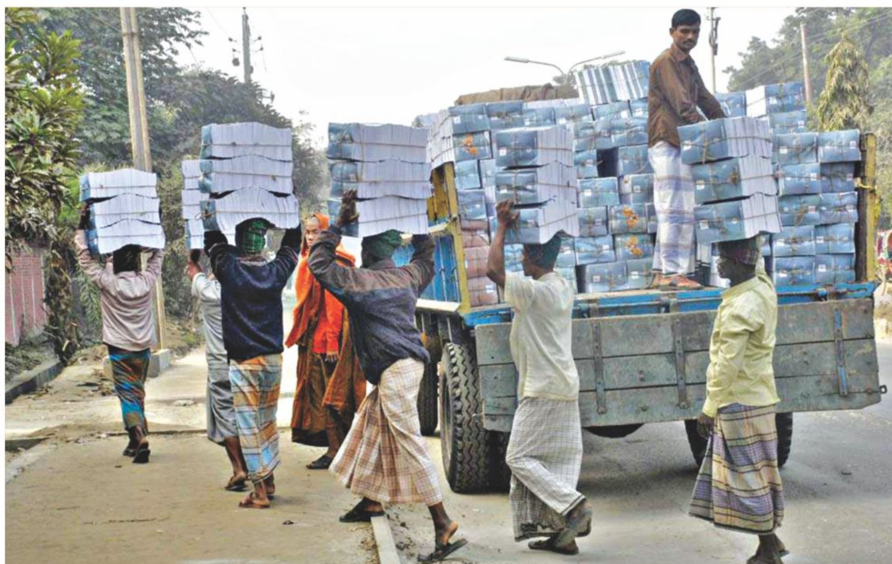
Workers unload free government textbooks meant for distribution among primary and secondary school students at Sher-e-Bangla Nagar in the capital yesterday. The government will start distributing the textbooks from January 1 so that those reach all students by the first week of the new academic session.

"The Teesta agreement still has some time to go because neither Sikkim state nor West Bengal state is fully aware of their rights about the river. Unless these rights are quantified and measured, how the agreement with Bangladesh can be concluded," Ray told a programme in Kolkata on Wednesday.