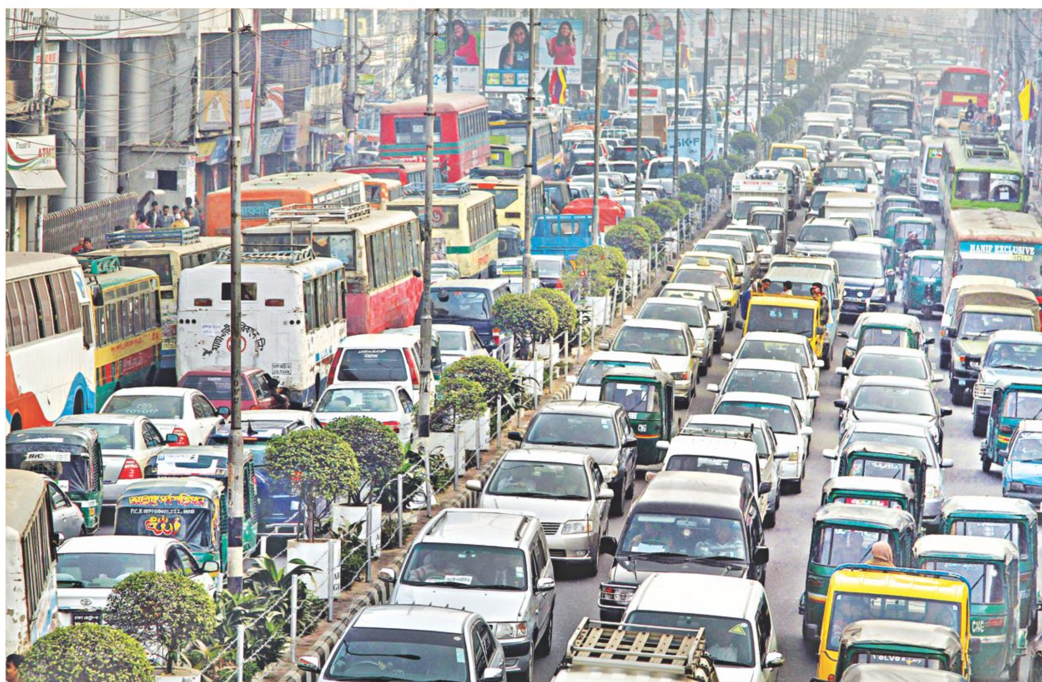
Bumper-to-bumper tailbacks choke the capital's Kazi Nazrul Islam Avenue around 3:00pm yesterday due to a procession of Jatiya Shonchalon Parishad moving from Manik Mia Avenue to Suhrawardy Udyan. The parishad was holding the procession demanding that the government expedite the war crimes trial.

All members of Management Net are requested to contact at 41/2 Purana Paltan, Suit E-4, Dhaka-1000 or call at 7161730 or 01819216652 for further