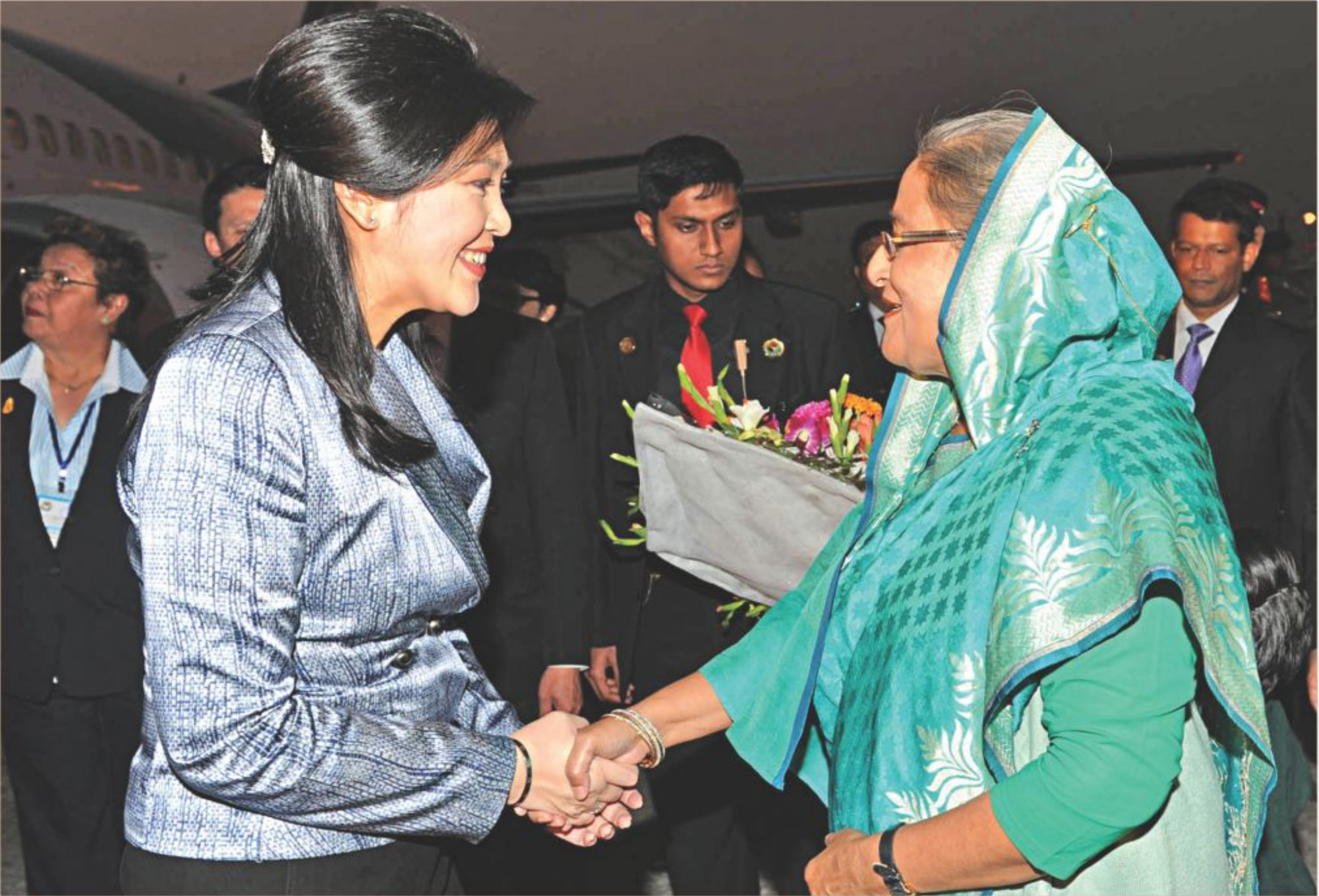
Prime Minister Sheikh Hasina receives her Thai counterpart Yingluck Shinawatra at the Hazrat Shahjalal International Airport yesterday.