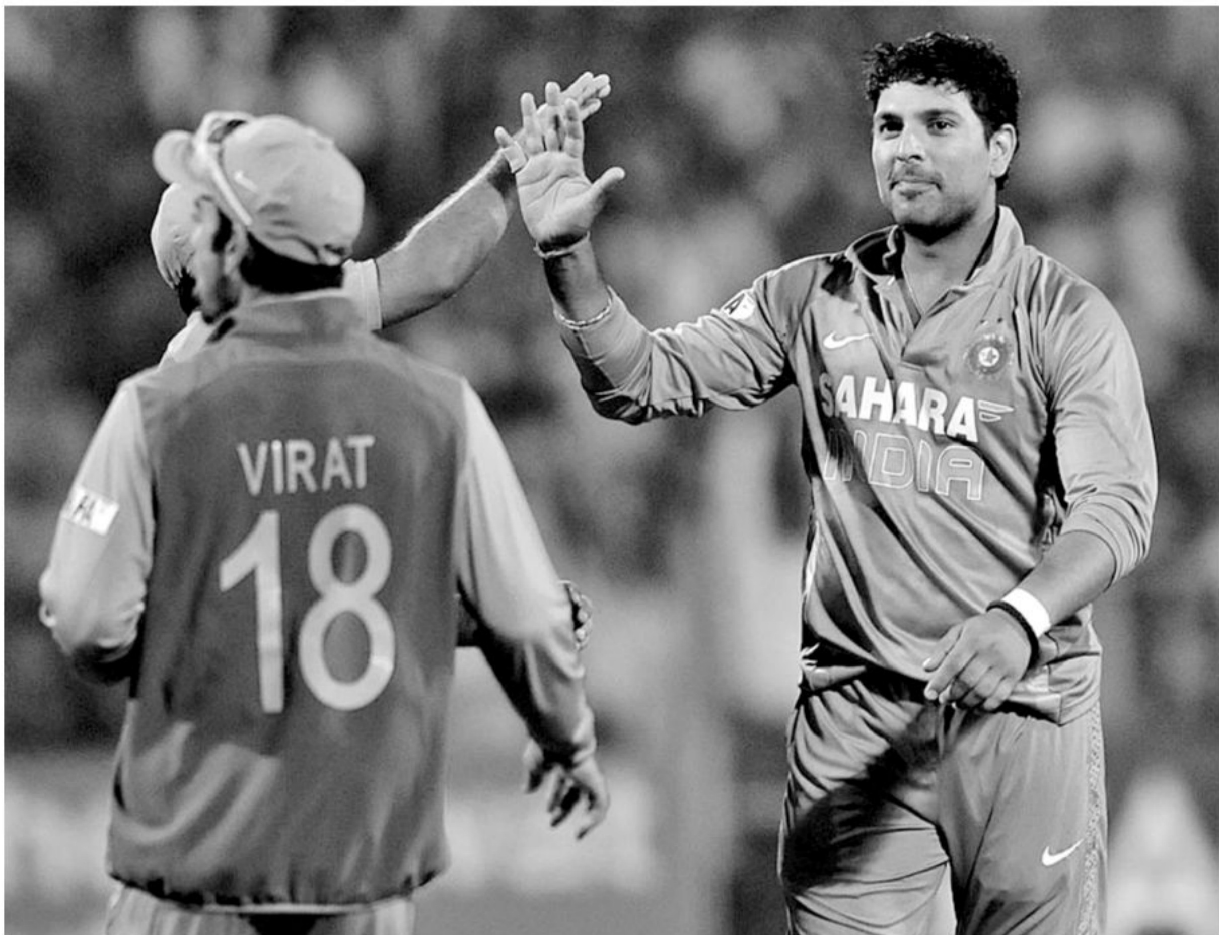
India all-rounder Yuvraj Singh (R) celebrates one of his three wickets with a teammate during the first T20I against England at Pune yesterday.