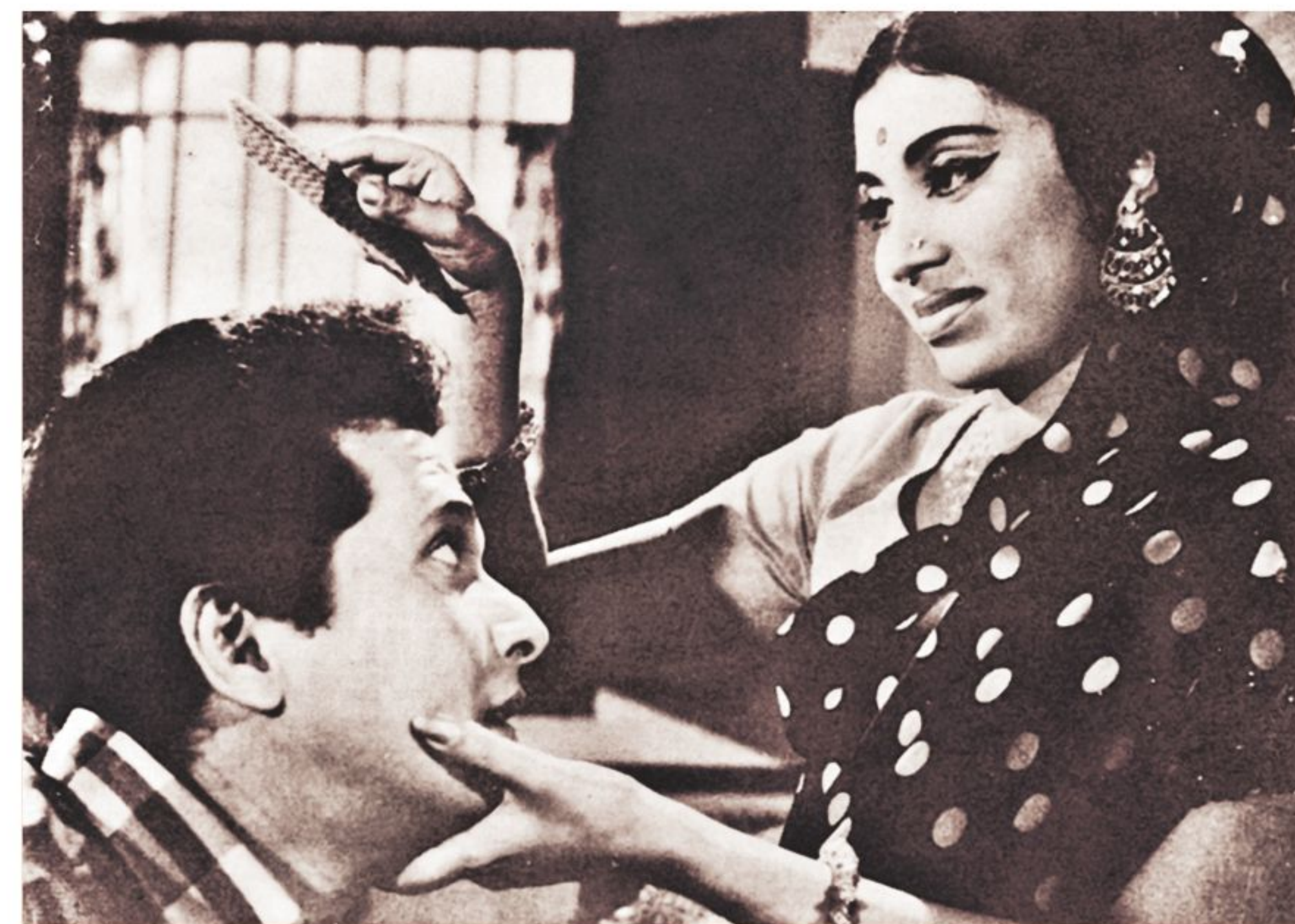
Scenes from "Abar Tora Manush Haw" (top) and "Jibon Theke Neyra".