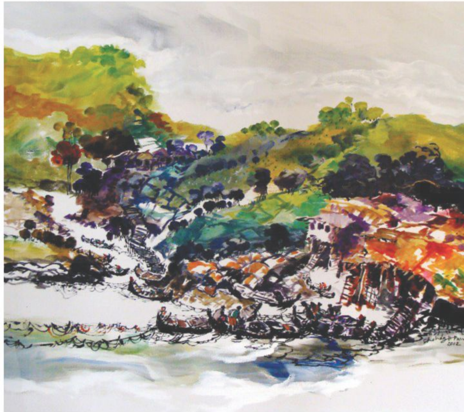
A watercolour by Shohag Parvez.