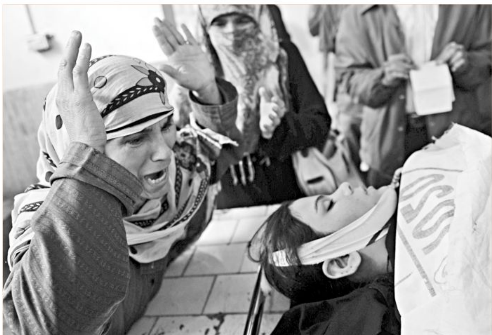
A Pakistani mother mourns over her daughter, who was killed while on the job as a polio vaccination worker, at a hospital morgue following an attack by gunmen in Karachi yesterday.

"Much focus has been paid in the media on recovering the Indian black money that has already been lost," he said suggesting policymakers should instead make curtailing the ongoing outflow of money priority number one.