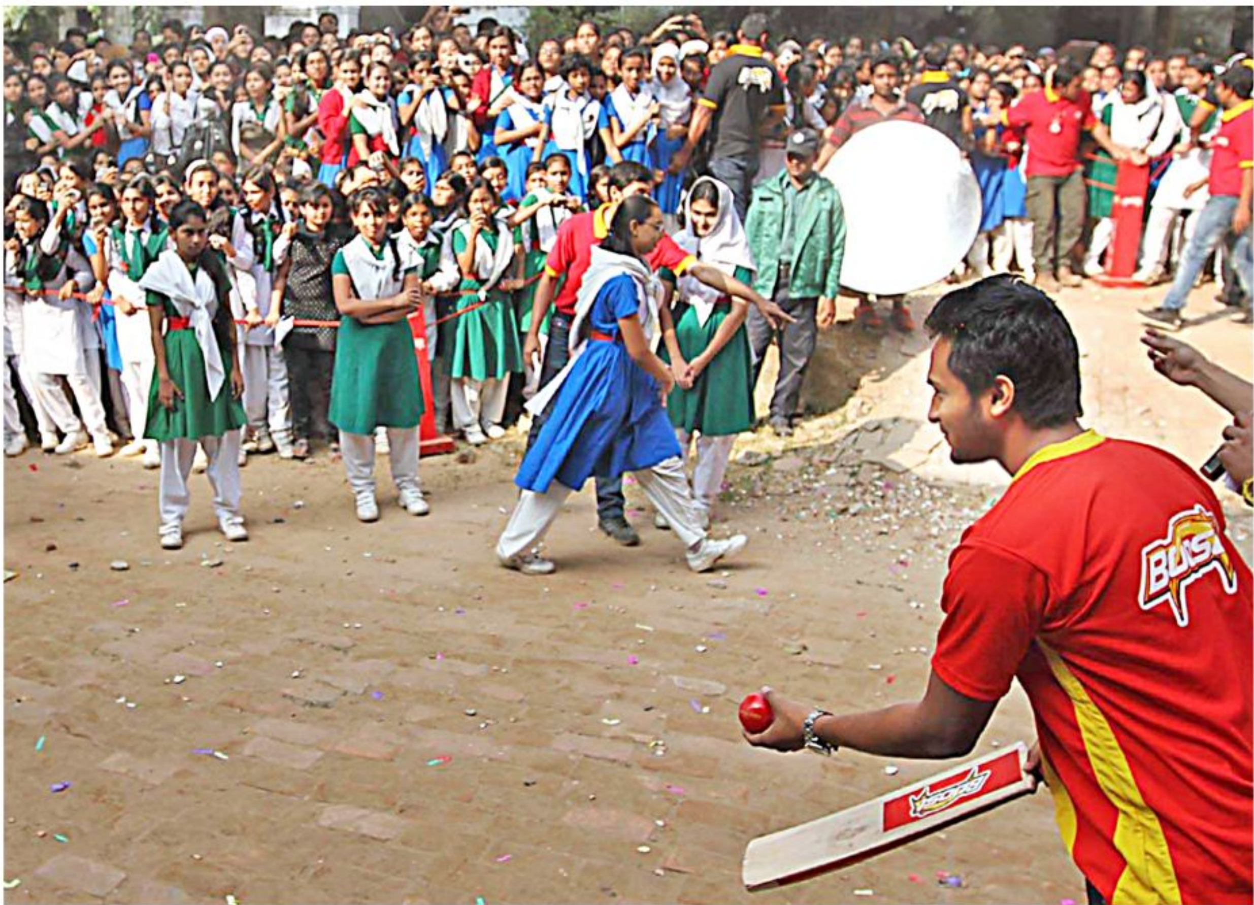
Star Bangladesh all-rounder Shakib Al Hasan gives some catching practice to girls of the Jamal Khan Dr. Khastagir Girls' High School in Chittagong yesterday. Shakib showed up at the school and spent an hour entertaining the students as part of a publicity campaign organised by Boost, and prize-winners were awarded with a bat autographed by the all-rounder.