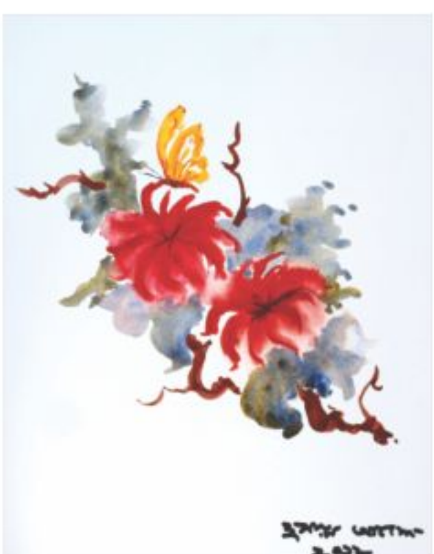
A watercolour by Humayun Ahmed.

On the occasion of the exhibition, a press conference was held yesterday at Bengal Café in Dhanmondi. Nasir Ali