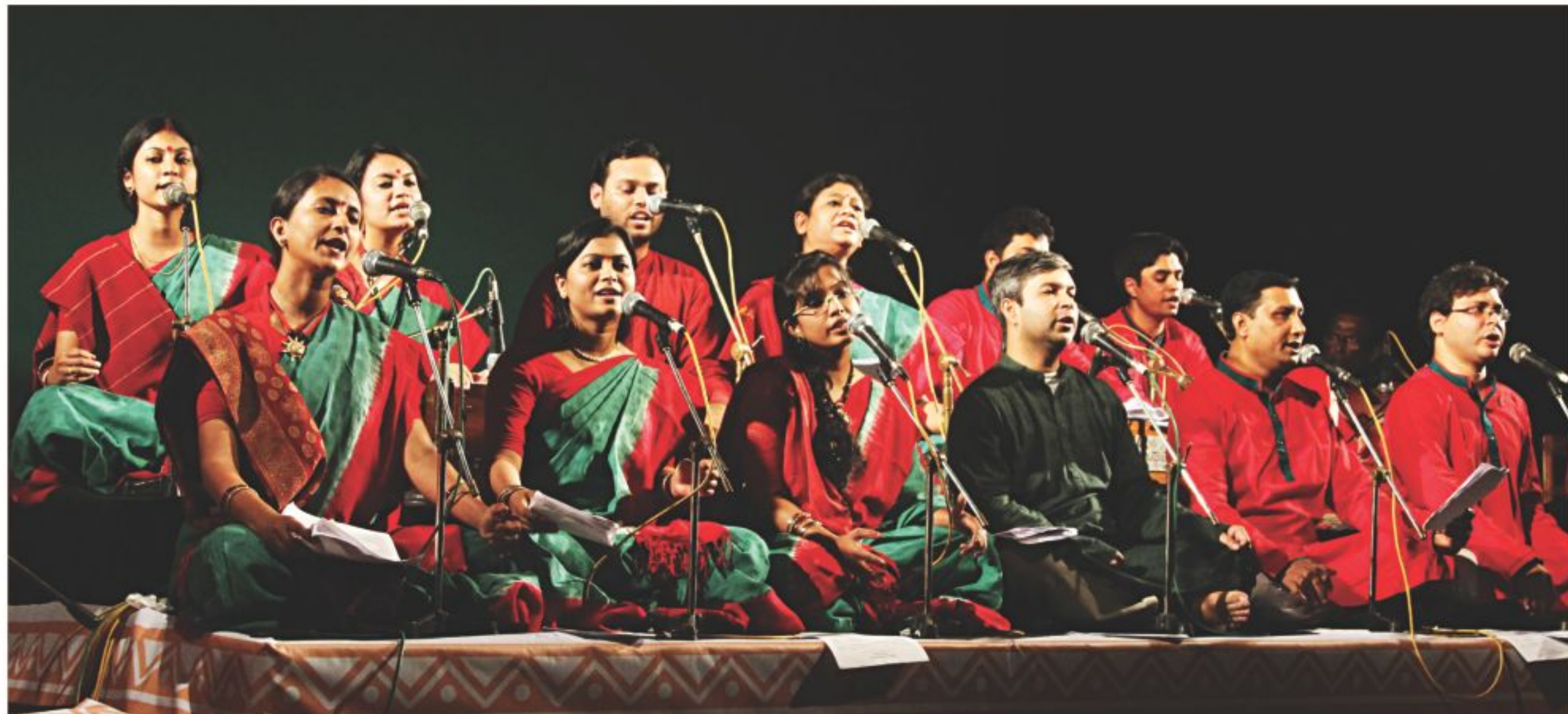
Artistes perform at the programme.