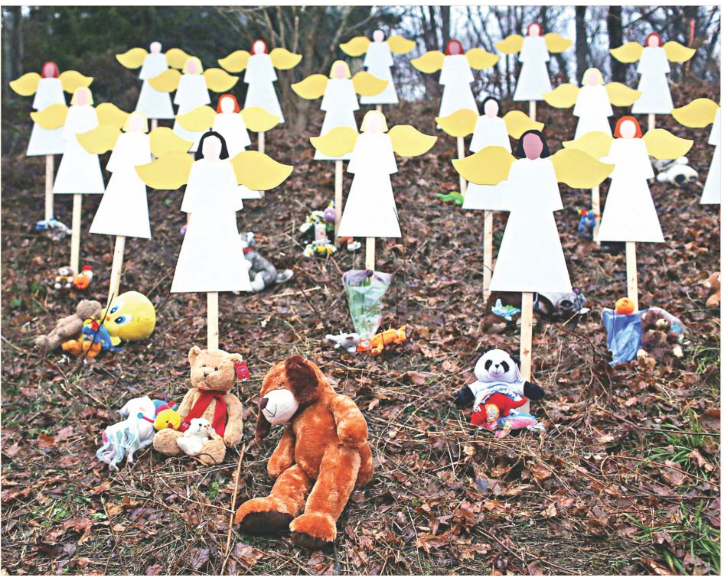
Twenty-seven angel wood cut-outs are set up on hillside in memory to the victims of an elementary school shooting in Newtown, Connecticut, on Sunday. Story on page 7.