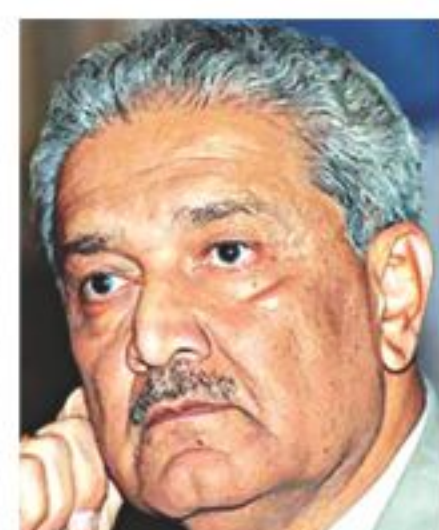
Abdul Quadeer Khan