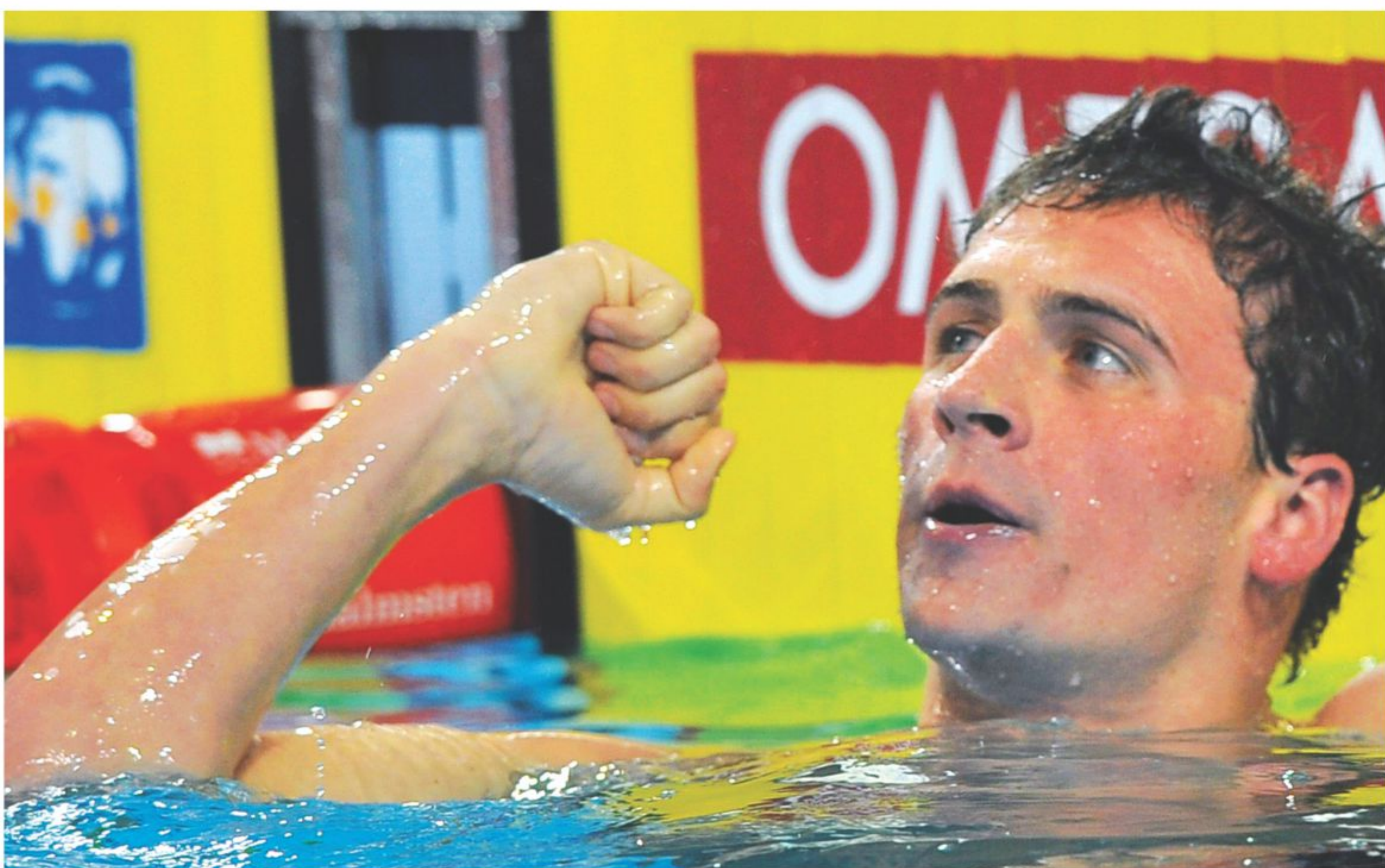
Ryan Lochte of USA celebrates his gold medal in the men's 200m individual medley at FINA World Short Course Swimming Championships in Istanbul on Friday.

"If I took the medal it would end up in a sock drawer, if I give it to a fan they're going to treasure it. It will make their day or even their life."