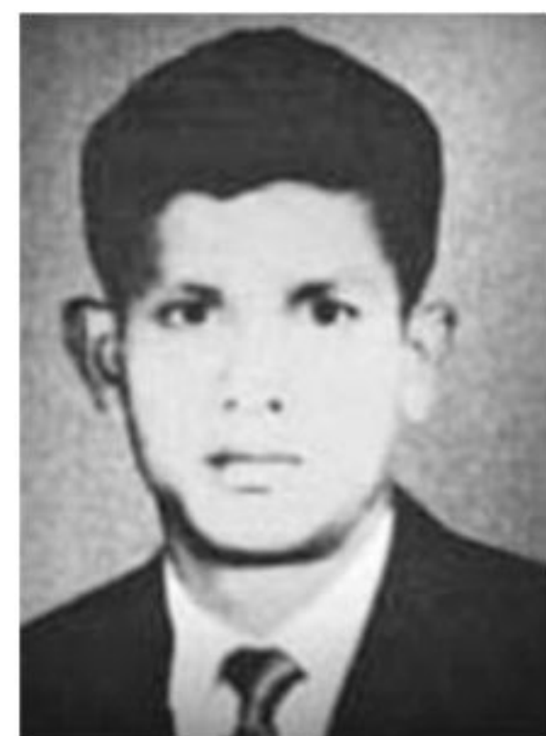
Bir Shreshtha Captain Mohiuddin Jahangir