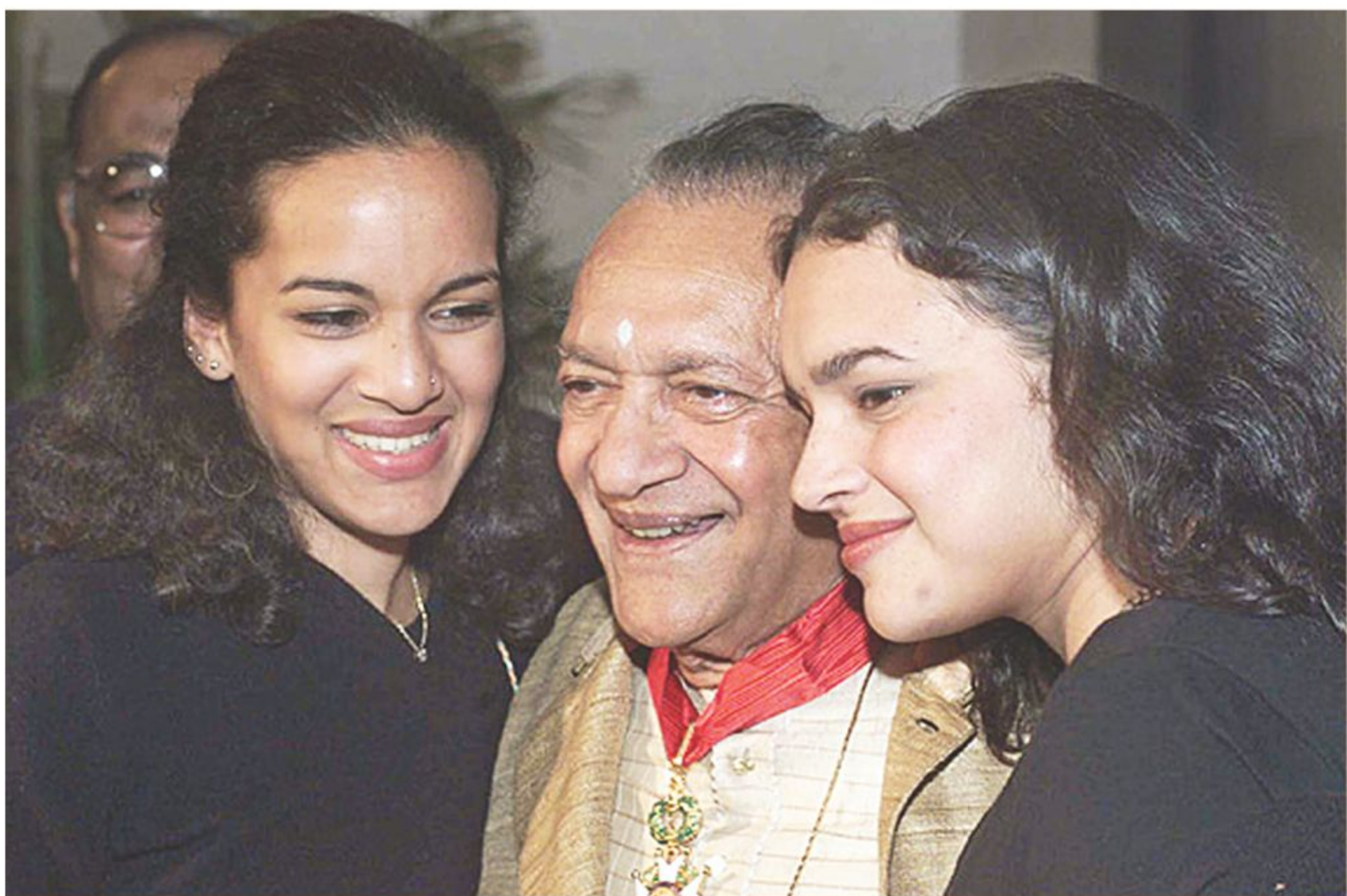
Pandit Ravi Shankar (C) with daughters Anoushka (L) and Norah Jones.

Labelled the "Godfather of World Music", Pandit Ravi Shankar undertook an extraordinary journey from the banks of Ganges to the heart of the West, mesmerising them with Indian ragas and partnering with musical greats like Beatles' George Harrison and Yehudi Menuhin. A darling of the hippie movement in the 1960s, Pandit Shankar trained for seven years under Ustad Allauddin Khan and was known for his characteristic sitar sound with powerful bass notes. Shankar, 92, whose health had been fragile for the past several years, died on December 11 (Tuesday) at the Scripps Memorial Hospital in La Jolla, California after undergoing heart-valve replacement surgery. The Bharat Ratna started as a dancer with the group of his brother Uday Shankar but gave it up in 1938 to learn sitar under Ustad Allauddin Khan. During the tour of Uday's dance group in Europe and America in the early to mid-1930s, Shankar discovered Western classical music, jazz, and cinema, and became acquainted with Western customs. The music doyen composed his first raga in 1945 and embarked on a prolific recording career. In the 1950s and 1960s, he became the unofficial