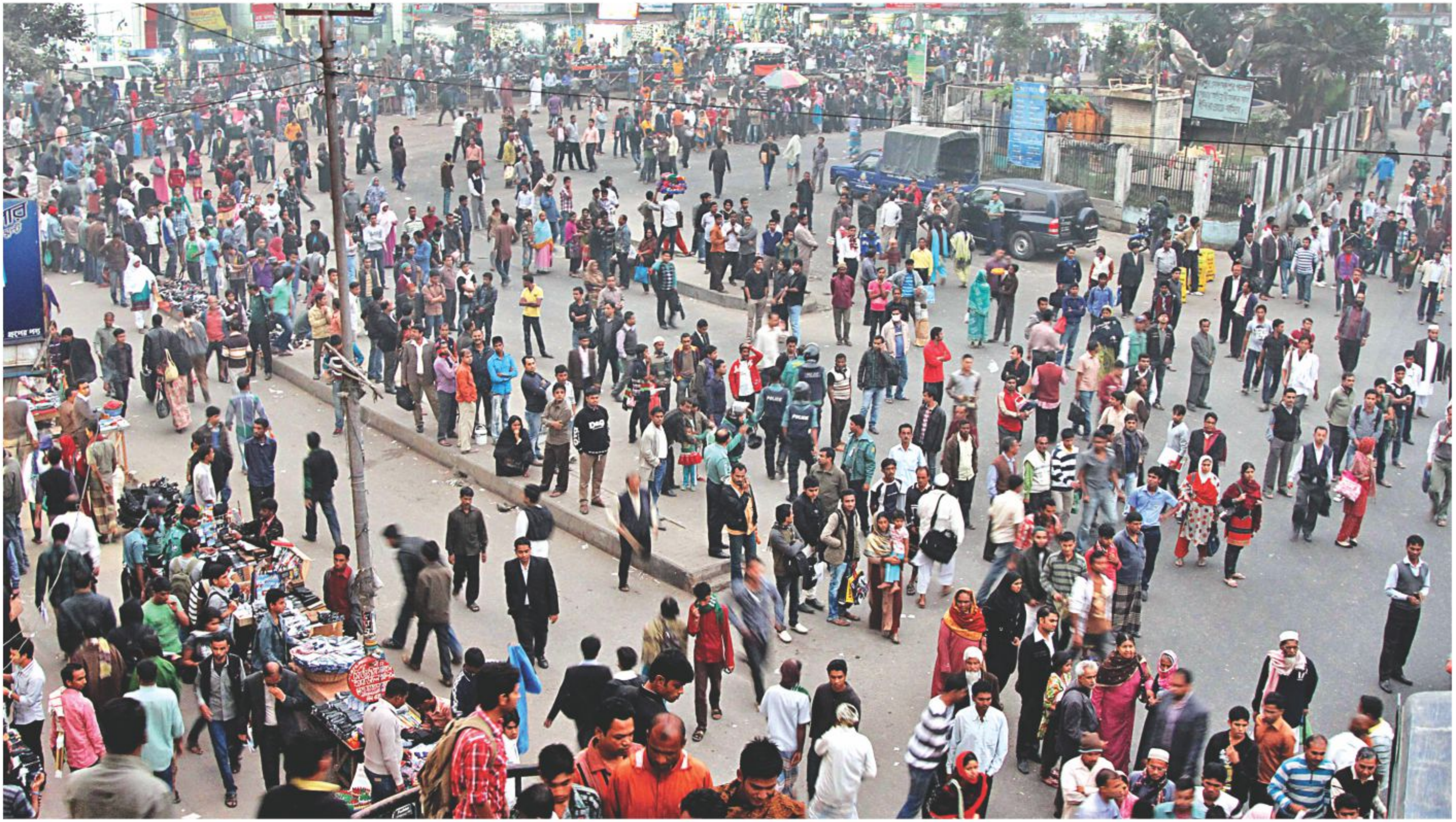
Fearing pre-hartal violence, transport owners kept their buses and other vehicles off the road causing sufferings to city commuters. The photo was taken at Farmgate intersection yesterday.