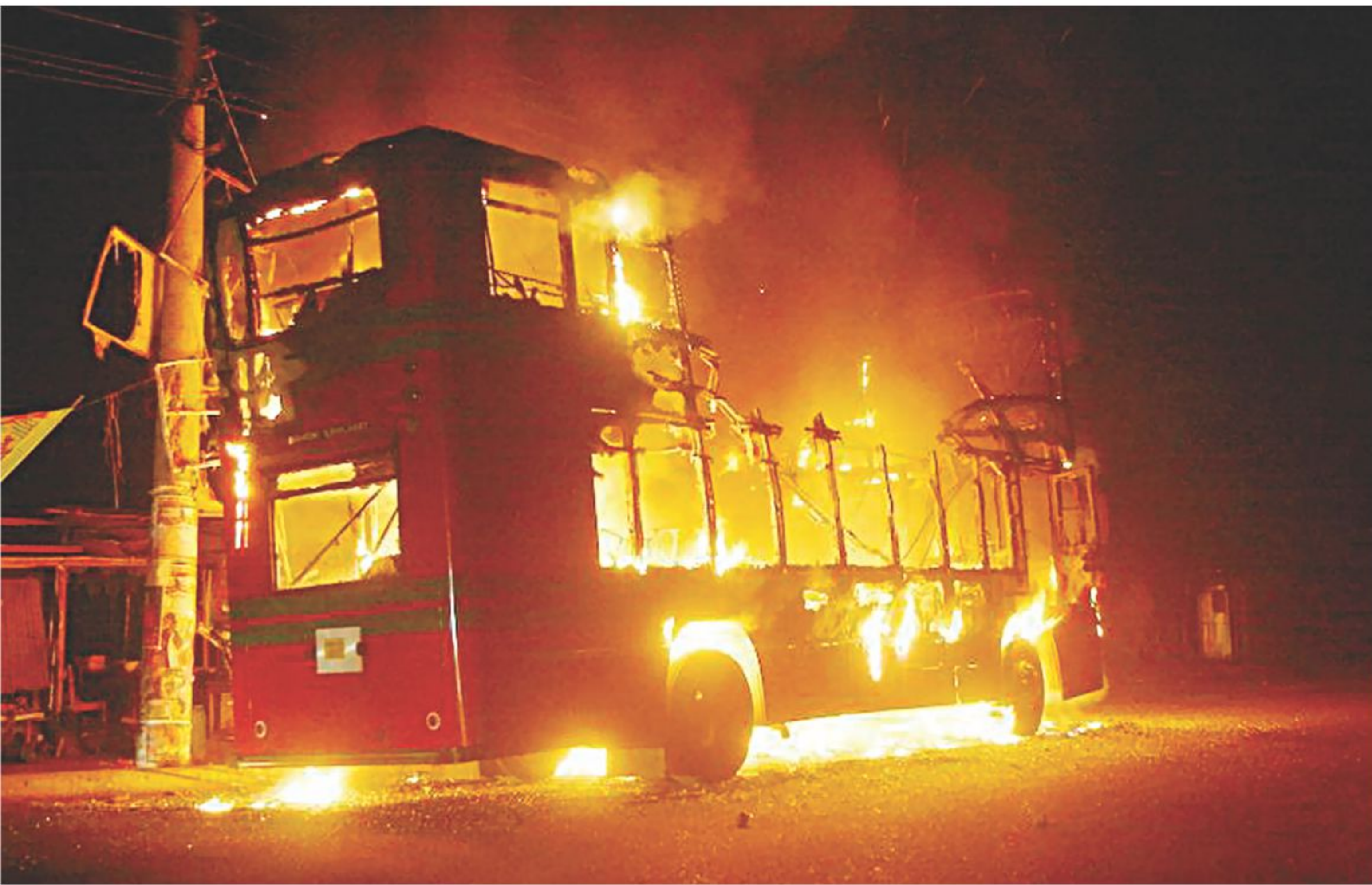
Hartal supporters in Shivbari BRTC bus stand of Gazipur set afire a double-decker bus yesterday evening.