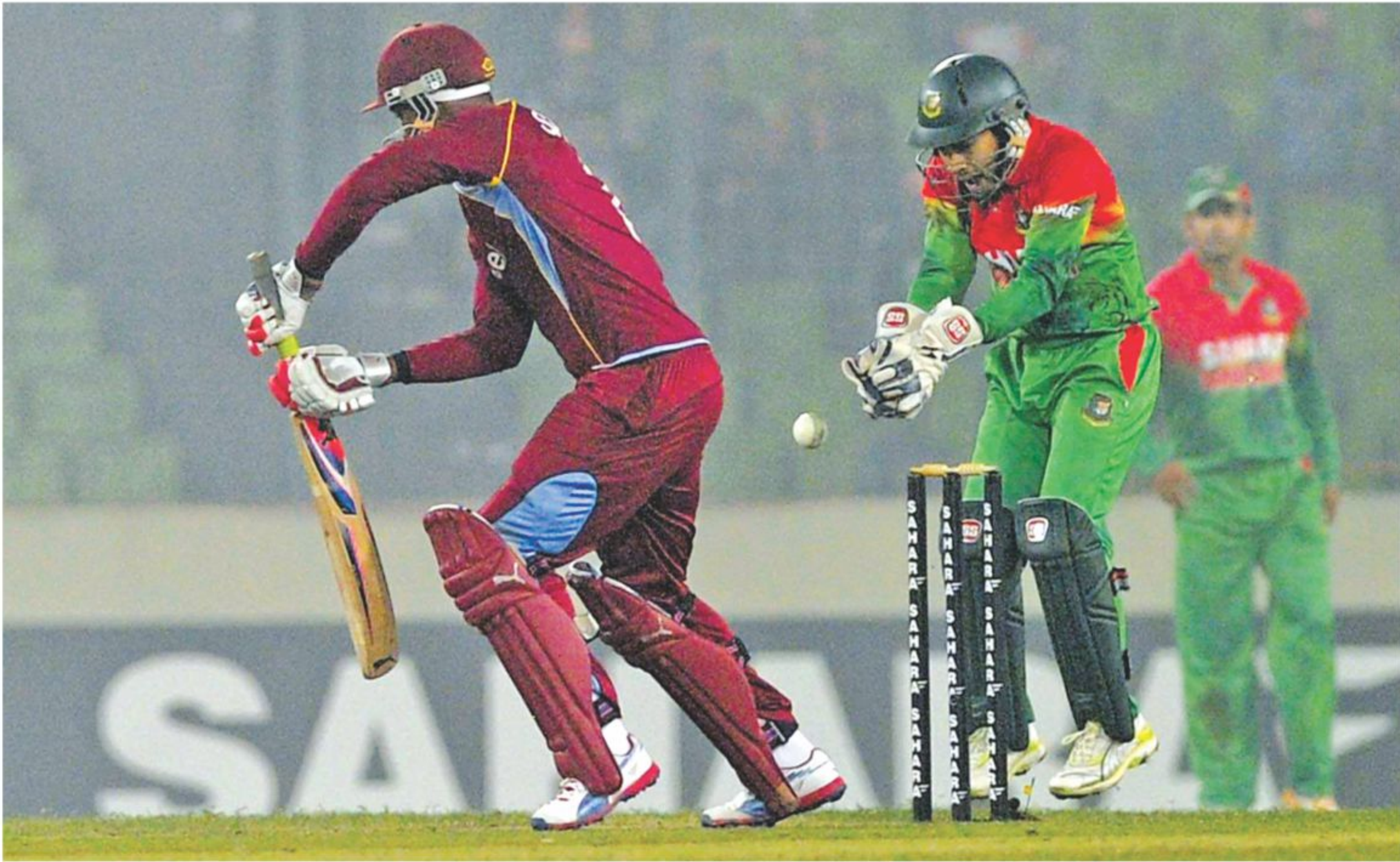
Bangladesh's wicketkeeper and captain Mushfiquur Rahim fluffs an edge off West Indies batsman Marlon Samuels during yesterday's T20I at the Sher-e-Bangla National Stadium. Mushfiquur later grassed another chance to dismiss the batsman off the same bowler. The missed chances proved crucial in the end as Samuels went on to hit an unbeaten 85 off 43 balls to take the game away from the Tigers.