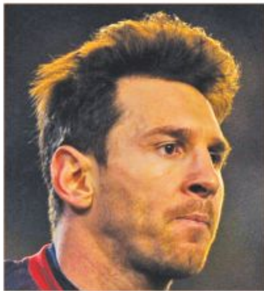
Lionel Messi 2012

Barcelona La Liga 56 Copa del Rey 3 Champions League 13 Spanish Super Cup 2 Argentina World Cup Qualifiers 5 Friendlies 7 Country Total 12