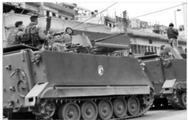
Lebanese army soldiers deployed at the entrance of Tripoli.

Six people were killed and at least 40 injured in the Lebanese city of Tripoli in clashes on Sunday between opponents and supporters of Syria's president.