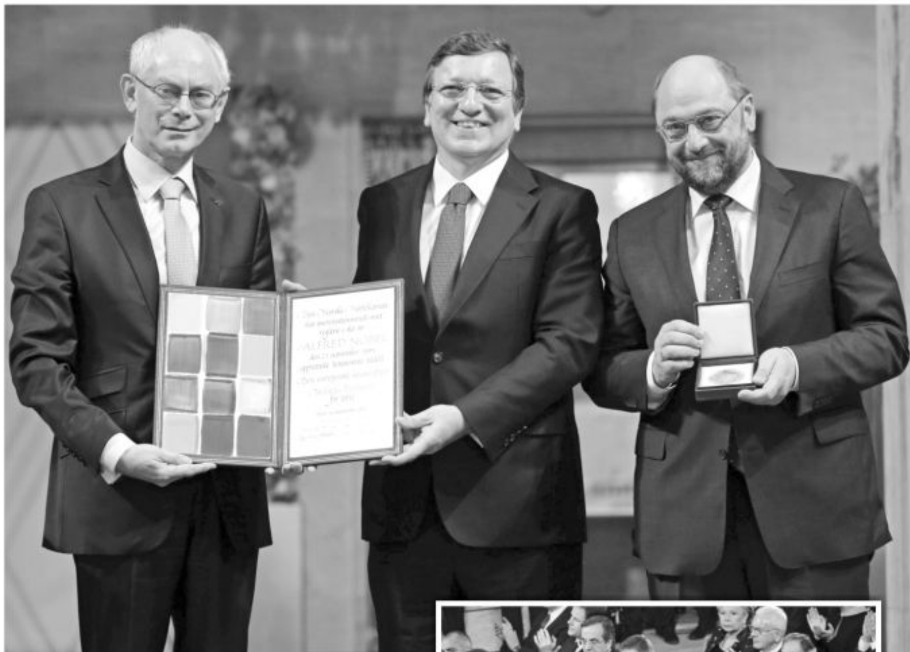
From left, European Council President Herman Van Rompuy, European Commission President Jose Manuel and European Parliament President Martin Schulz pose with the Nobel diploma during the Nobel Peace Prize ceremony at the Oslo City Hall Norway yesterday. Inset, European leaders and dignitaries applaud.