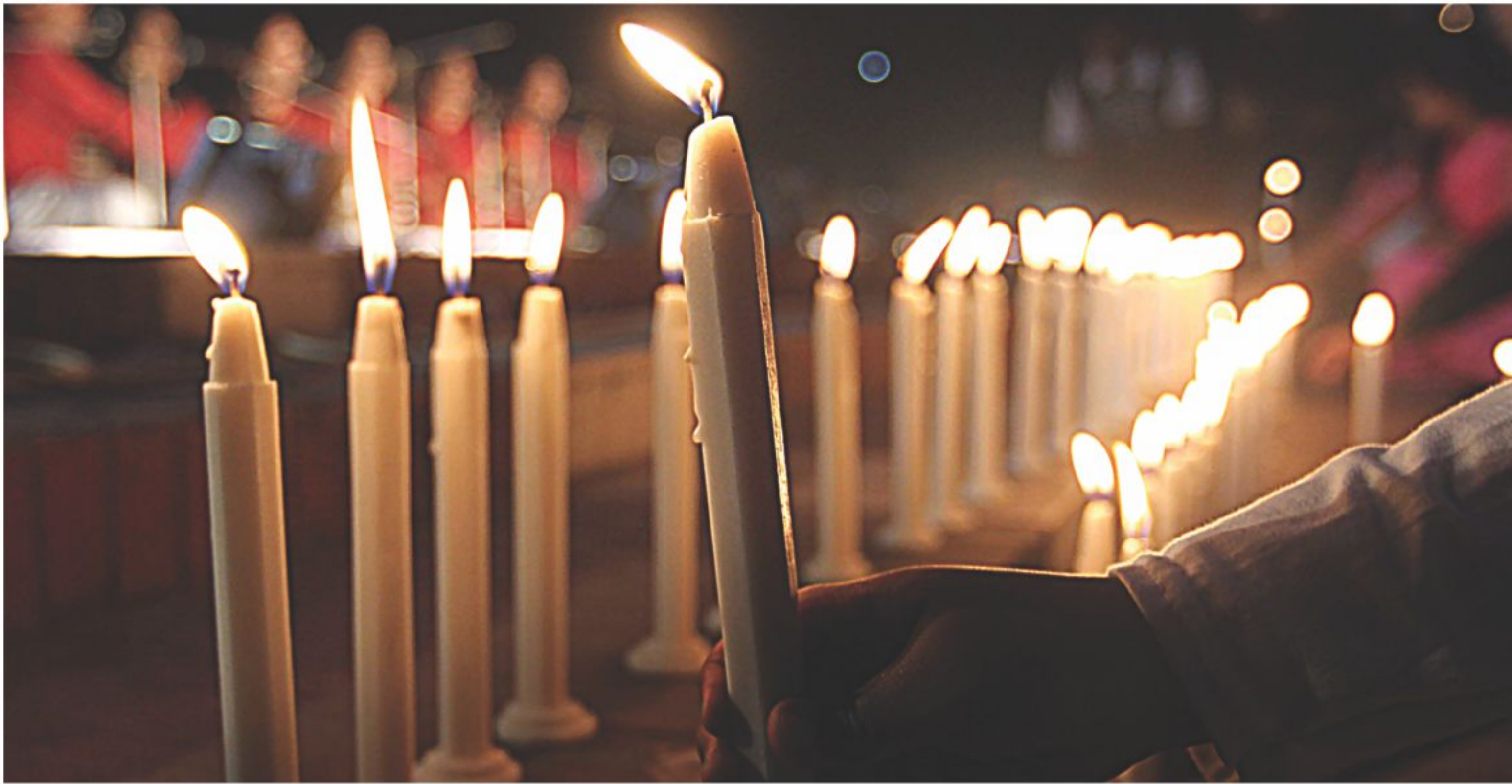
A candle-lit vigil held at the Central Shaheed Minar yesterday commemorates the martyrs of Liberation War, 1971. Naripokkho, a platform of women activists, arranged the event.