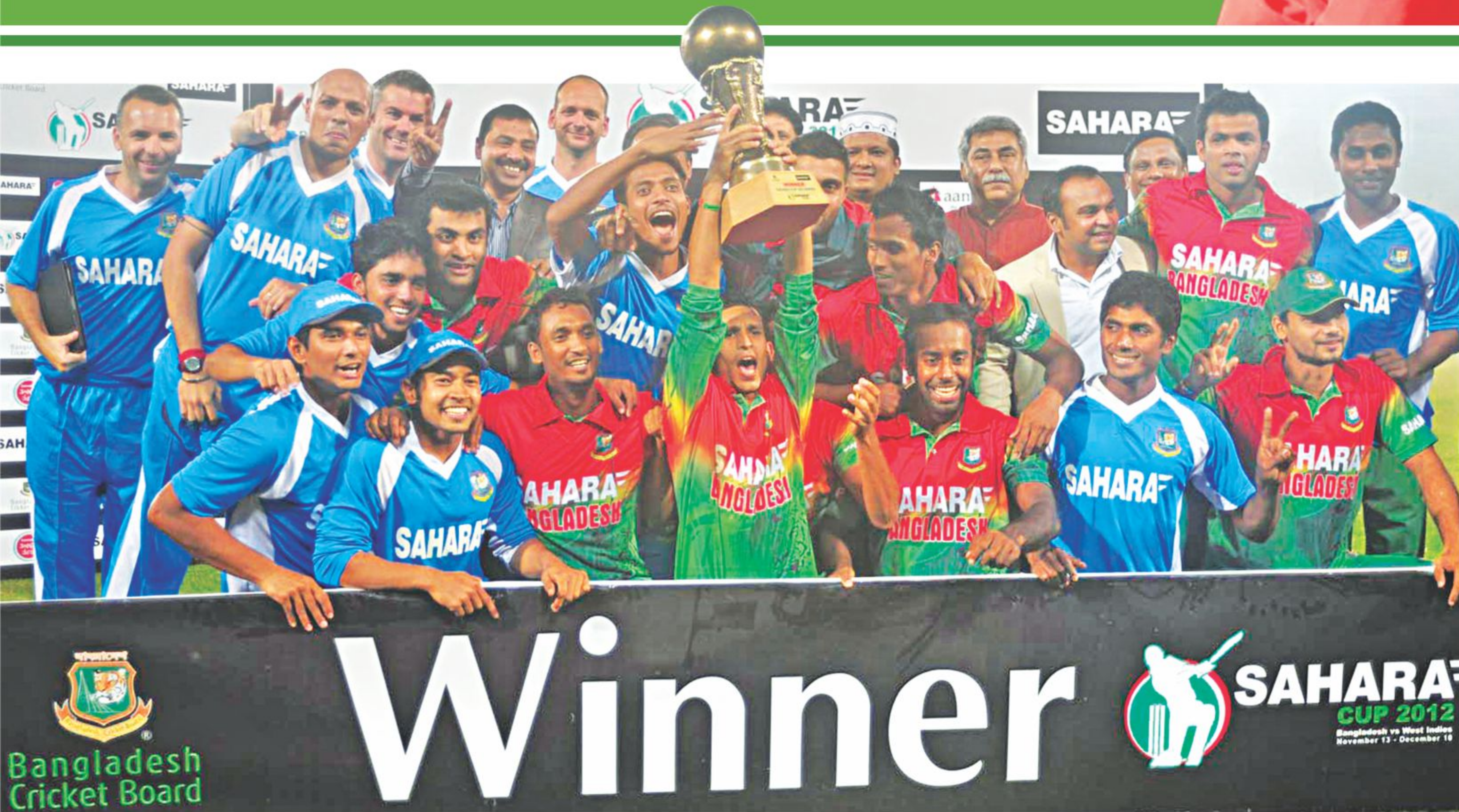
Bangladesh players celebrate with their second major silverware after defeating the West Indies in the fifth and final ODI at the Sher-e-Bangla National Stadium in Mirpur yesterday.