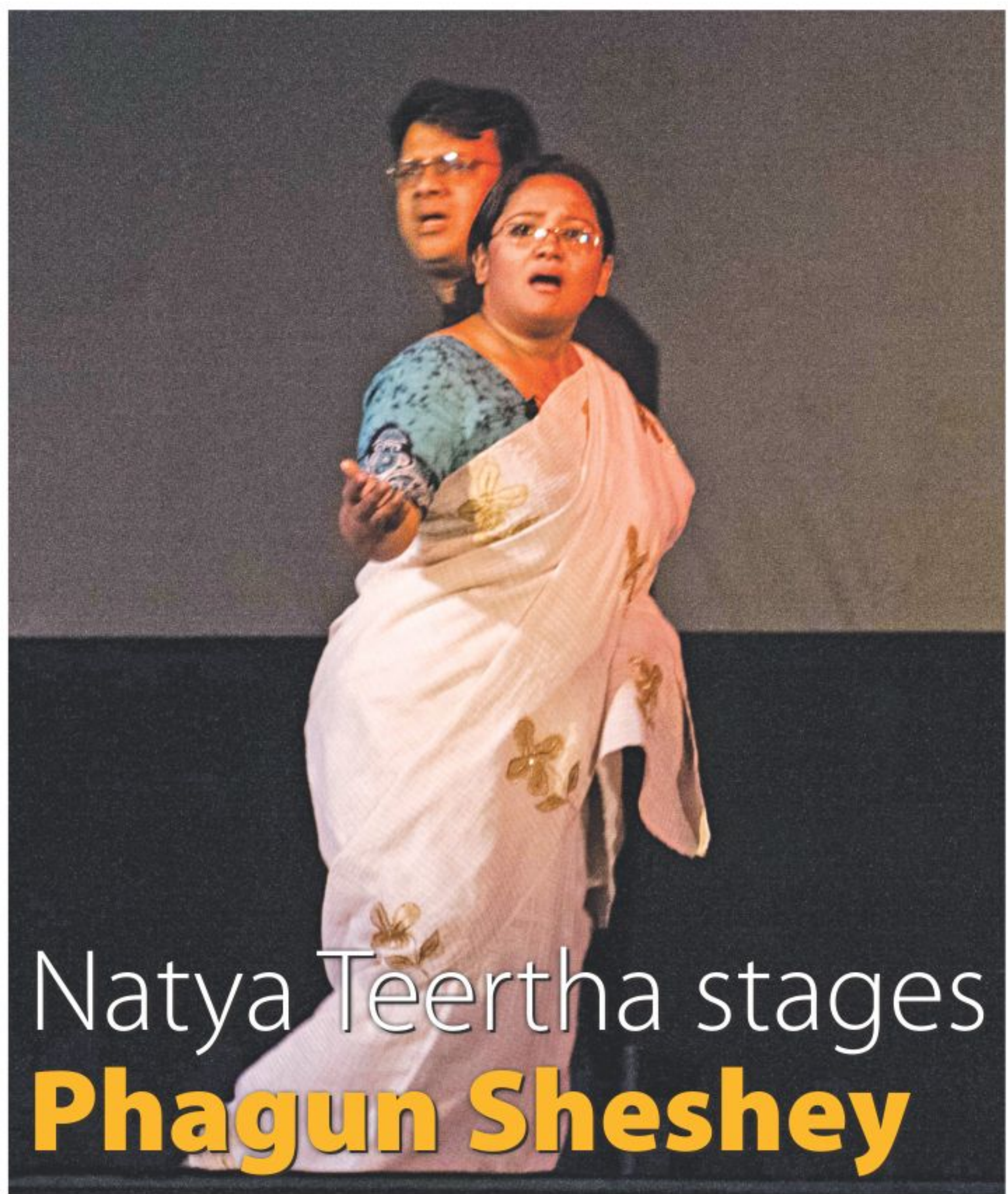
Natya Teertha stages Phagun Sheshey

Victory Festival 2012 Organiser: Sammilito Shangkritik Jote Venue: Central Shaheed Minar, Dhaka Date: Dec 14-16; Time: 4pm