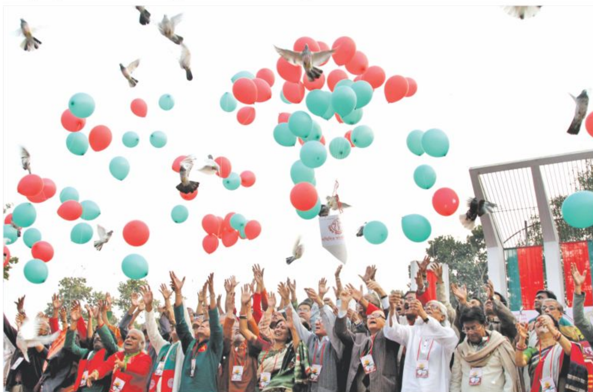
Cultural personalities inaugurate the festival.