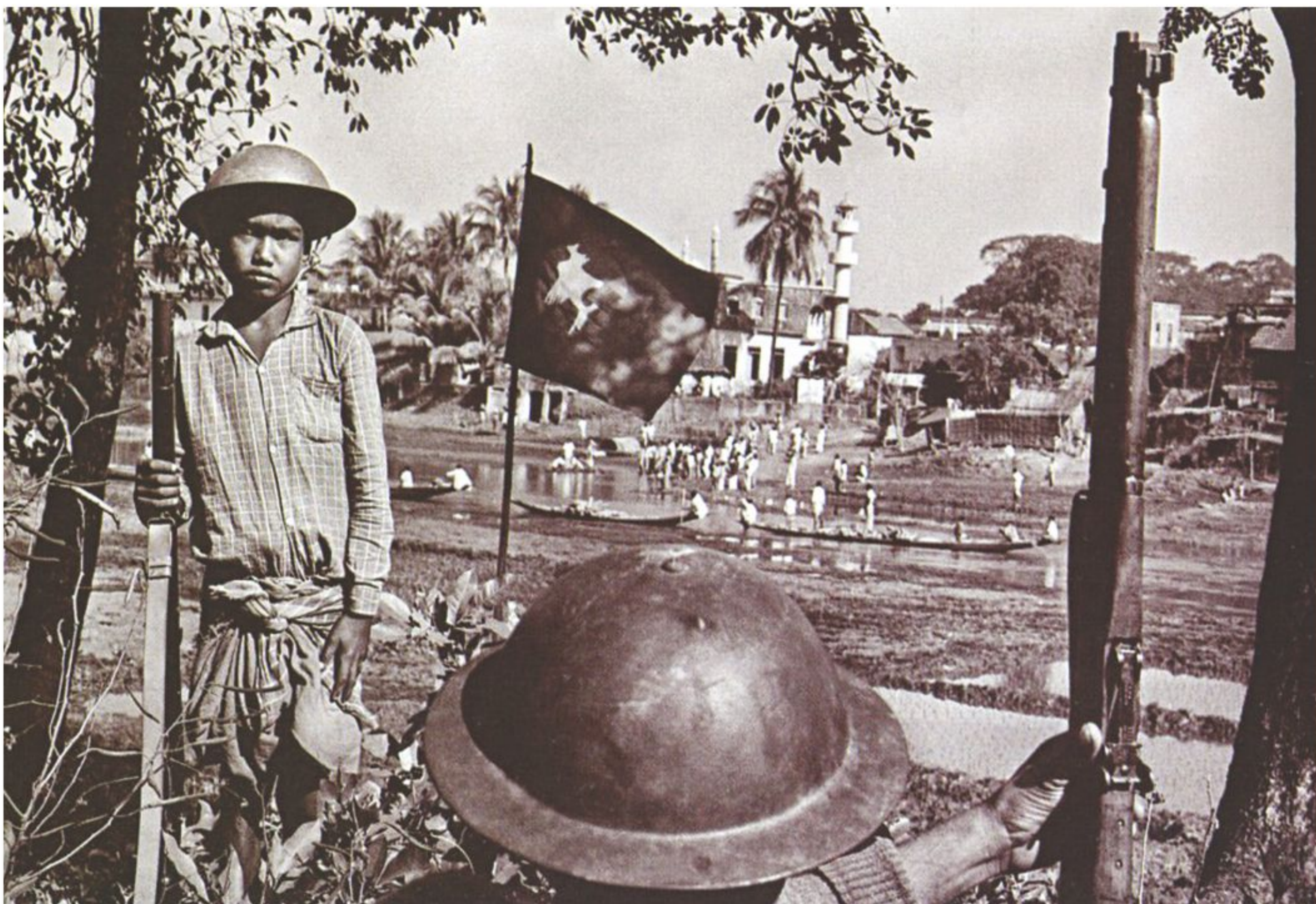
These images documented a nation persecuted and dehumanised, a nation fighting tooth and nail against Pakistan army to stay alive and be free.

Advocate, recalled India's sincere cooperation during the 9-month long war, particularly providing shelter to 10 million Bangladeshis, with gratitude.