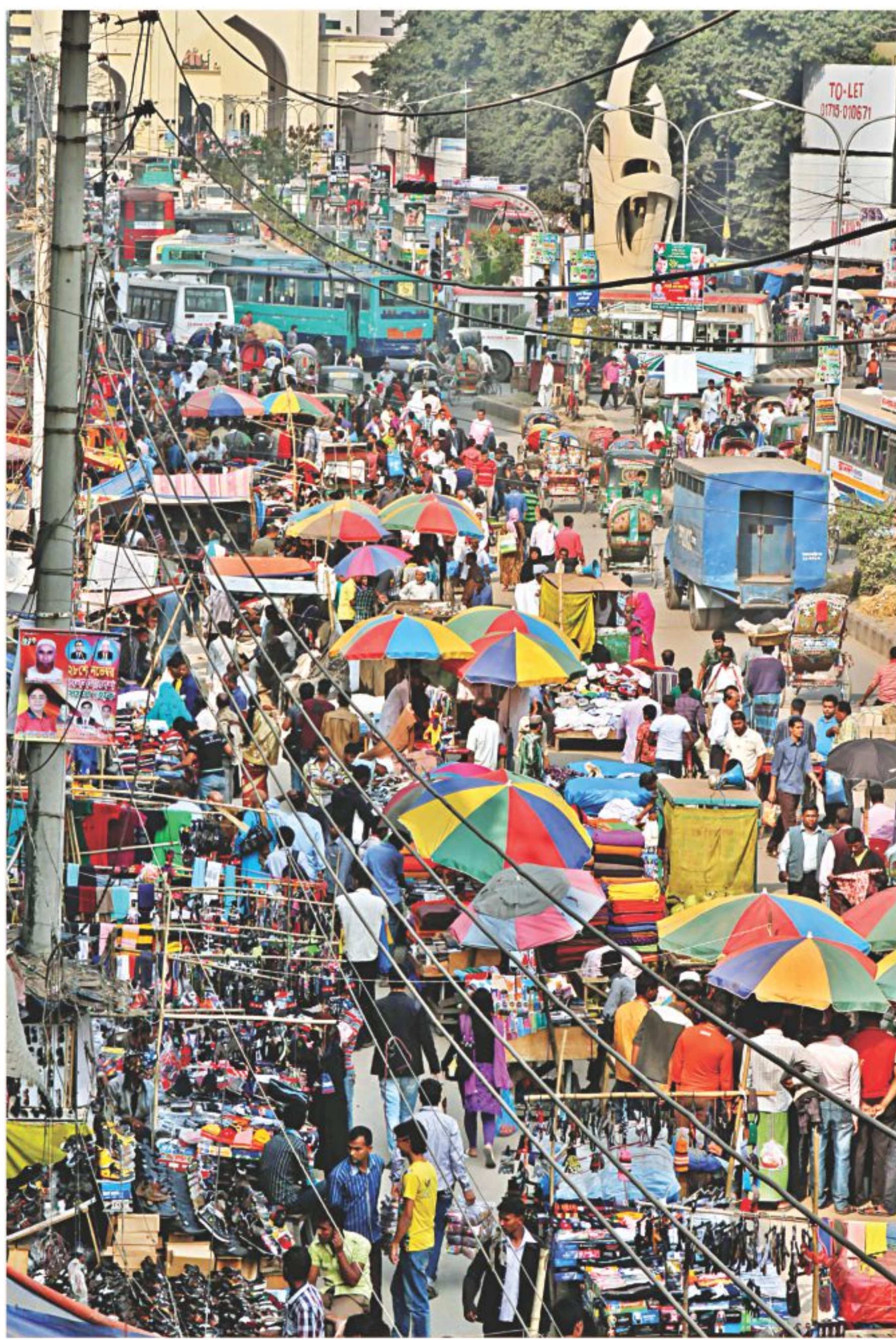
Hawkers occupy the pavement and a large section of the streets in Gulistan area. This part of the capital is notorious for its congestion and a large number of buses begin their journeys from here.

Prime Minister Sheikh Hasina yesterday assured the private sector of providing all kinds of support, saying that her government wants to work more closely with the sector to speed up the country's development. She also said a process is underway to enact the Public-Private-Partnership (PPP) Law with provisions for transparent process in selecting private partners for the implementation of PPP projects. The premier made the remarks while inaugurating the two-day PPP Global Investors' Forum: Bangladesh 2012 at Ruposhi Bangla Hotel in the morning. Hasina said the country is fortunate to have a very dynamic and vibrant private sector that is globally recognised for its innovativeness, adaptability, and resilience. "For its [private sector] further flourishing, we are ready to provide all necessary materials and human SEE PAGE 6 COL 8