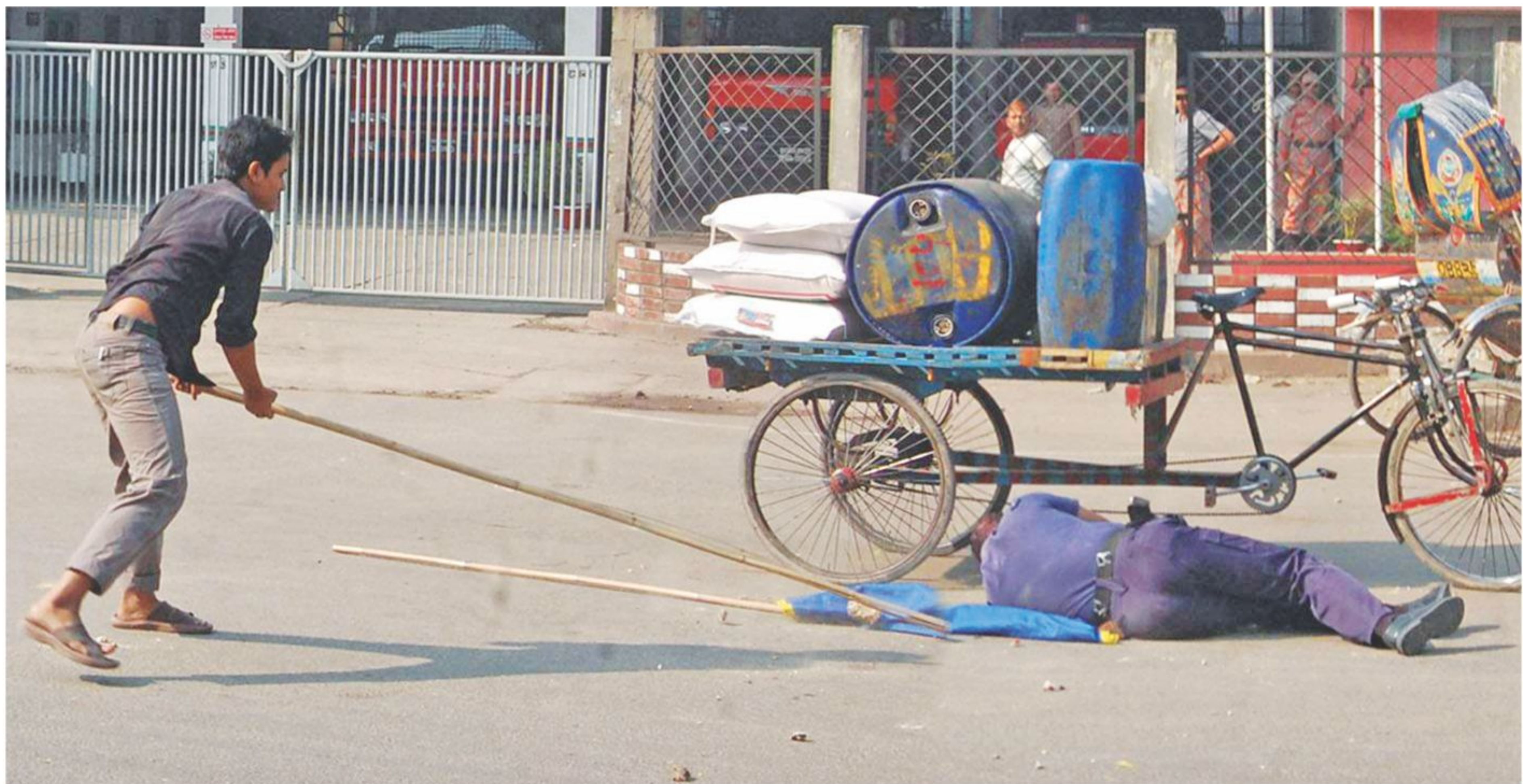
A policeman lies motionless on a road in Narayanganj yesterday after an attack by Jamaat-Shibir activists, but this young man continues to beat him up with a large stick.