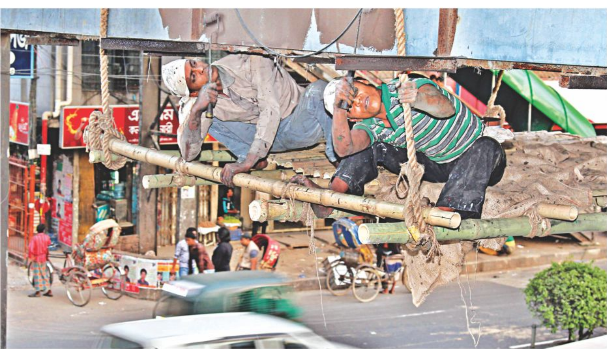
Workers with no safety gear repaint a footbridge over Kazi Nazrul Islam Avenue near Farmgate yesterday in a tight space as the platform leaves room for double-decker buses to pass underneath. It is baffling why this job was not done at night when traffic is low closing a lane of the thoroughfare.