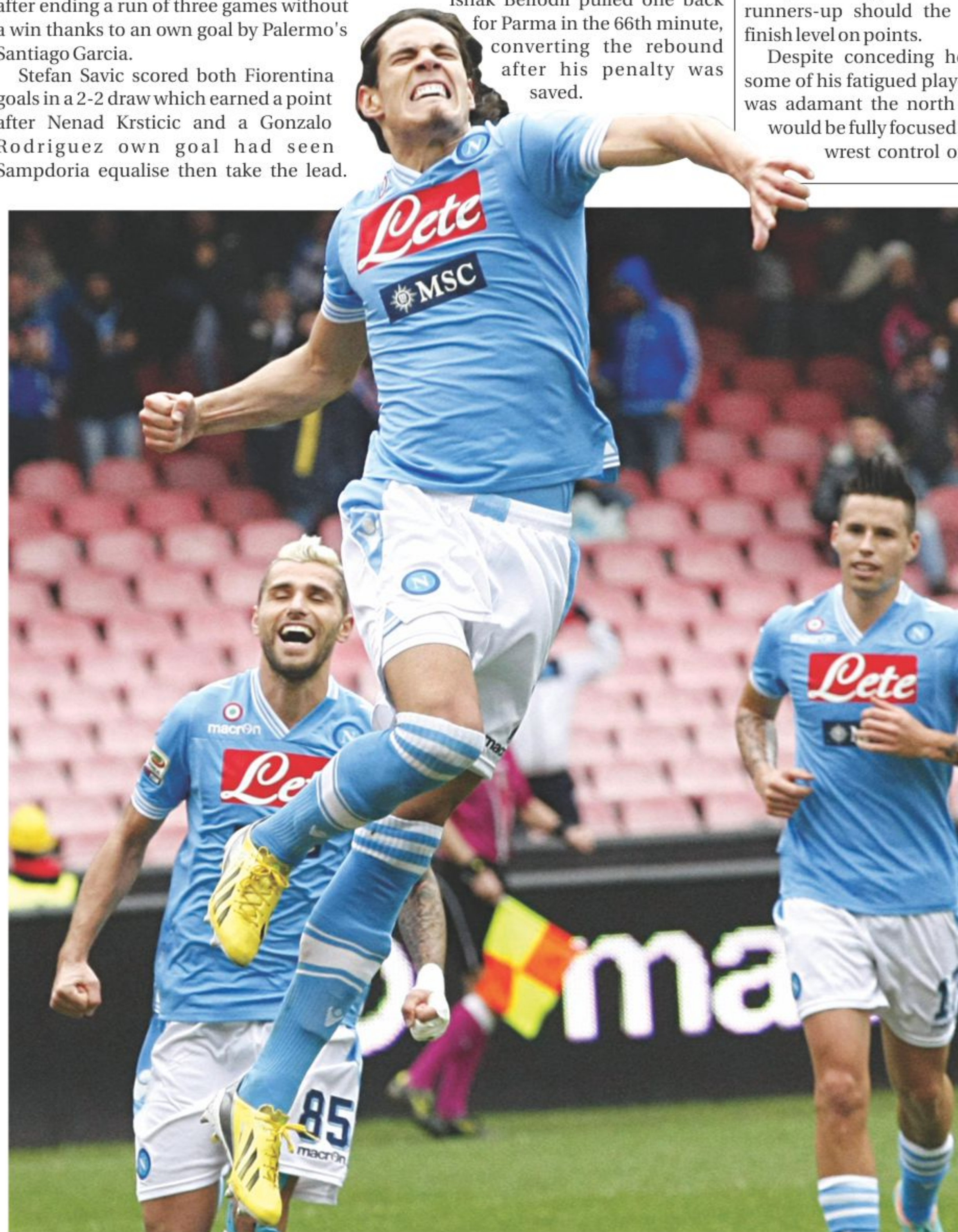
Napoli striker Edinson Cavani (C) is ecstatic after one of his two strikes against Pescara during their Serie A encounter at the San Paolo Stadium on Sunday.

Ishak Belfodil pulled one back for Parma in the 66th minute, converting the rebound after his penalty was saved.