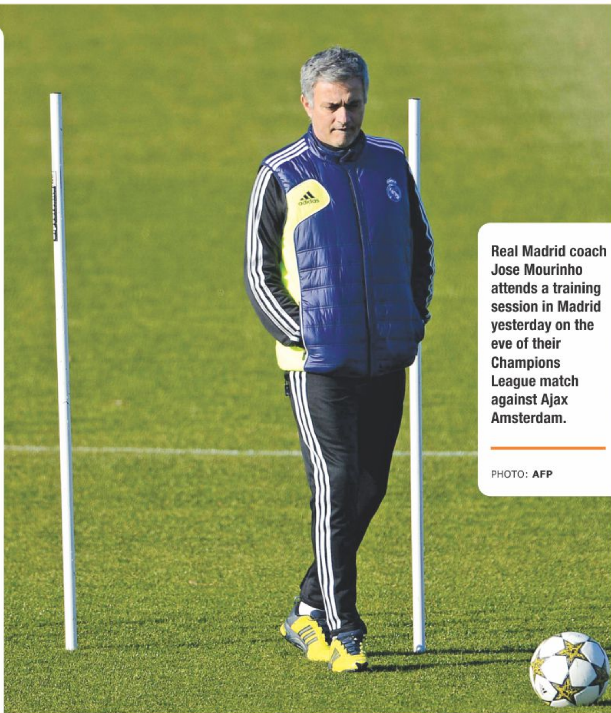
Real Madrid coach Jose Mourinho attends a training session in Madrid yesterday on the eve of their Champions League match against Ajax Amsterdam.

Real have qualified for the last 16 as the second placed side in Champions League Group D behind Borussia Dortmund. They host Ajax in their final group match on Tuesday.