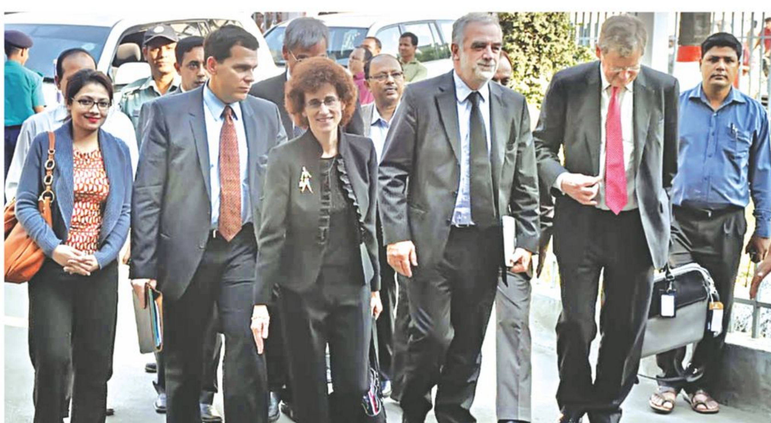
A World Bank team arrives at Anti-Corruption Commission's head office in the capital yesterday to hold a meeting on the anti-graft body's progress in investigations into the Padma bridge project corruption.

However, Jyotirindra Bodhipriya Larma, chairman of CHT regional council said, confusion, disappointment and mistrust are prevailing in hill peoples' mind due to the government's inactiveness regarding implementing the CHT accord.