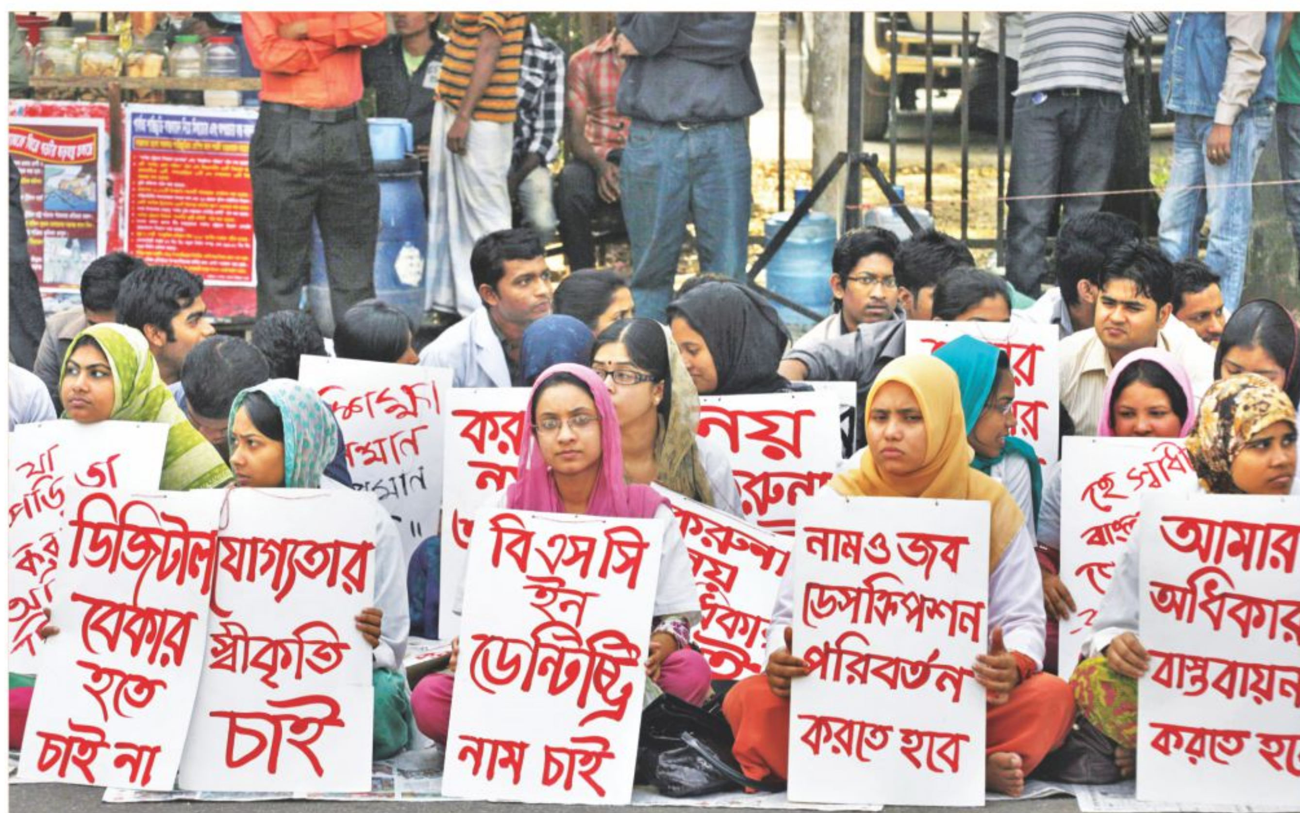
BSc in Health Technology (Dental) Students' Association yesterday holds a rally in front of Jatiya Press Club in the capital with a five-point demand, including changing the programme name into BSc in Dentistry, creation of job opportunity for them and introduction of a four-year academic programme along with one-year internship.

He was talking to journalists after placing wreaths at the grave of late president Ziaur Rahman in the capital. Muktiyuddho Projonmo organised the programme.