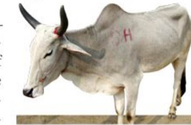
SEE PAGE 6 COL 1

In a controversial suggestion, outgoing BSF chief UK Bansal has said the menace of cattle smuggling on the India-Bangladesh border defies