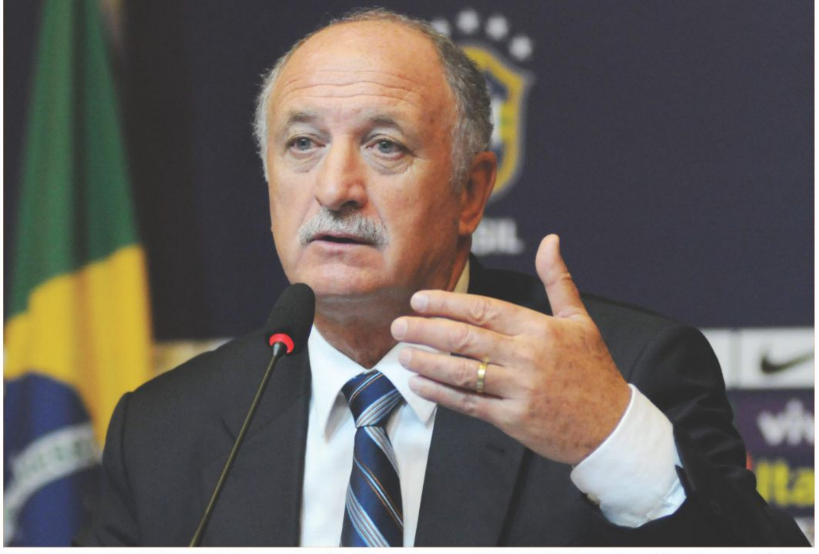
Brazil's new coach Luiz Felipe Scolari answers questions during a press conference in Rio de Janeiro on Thursday.

"The objective is clear -- to win the World Cup in 2014. I don't feel under pressure. The players are the ones with pressure on them." A year after his initial arrival Brazil landed their fifth world title -- the Pentacampeao. Now it is a Hexacampeao that Scolari and his sidekick, 1994 winning coach Carlos Alberto Parreira, are tasked with winning -- using next summer's home Confederations Cup as a springboard. "I am happy to work with people who have confidence in me and happy to have at my side someone to share in this task -- that is, Parreira," said Scolari. "The World Cup project is starting off strongly," said the man named 'Felipao'. "Our sole commitment is to seek out