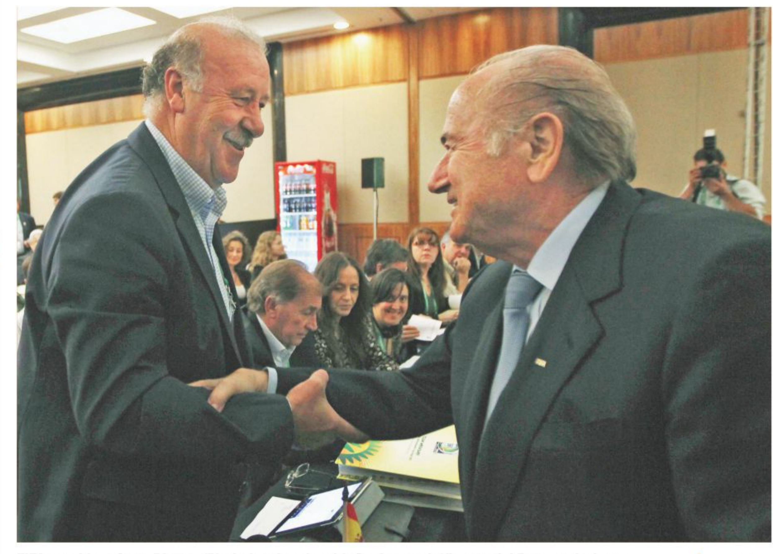
FIFA president Sepp Blatter (R) shakes hands with Spain coach Vicente del Bosque during a Team Workshop for the 2013 Confederations Cup in Sao Paulo on Thursday.