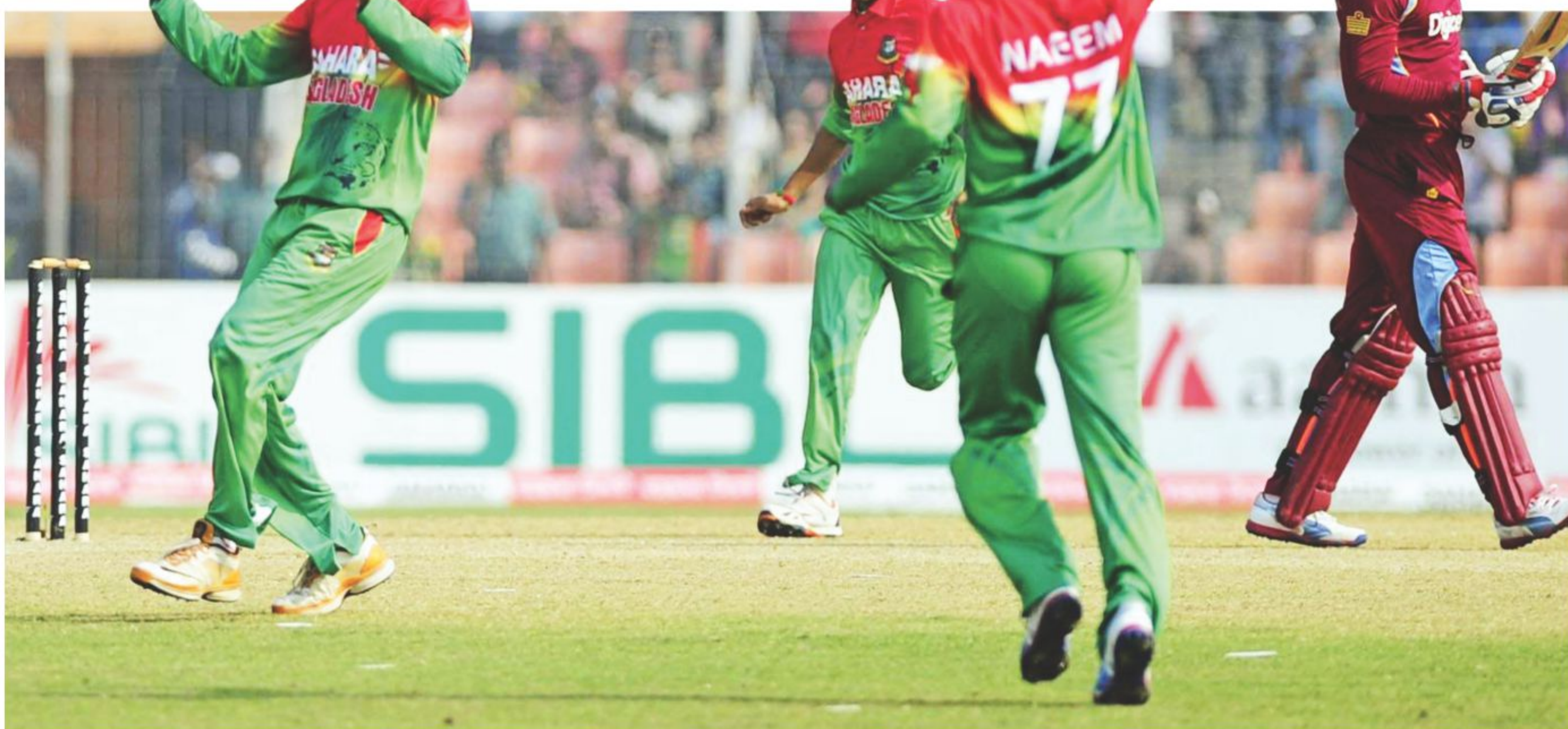
Bangladesh's debutant spinner Shohag Gazi (L) is ecstatic after dismissing West Indies batsman Marlon Samuels (R) during the first ODI at the Sheikh Abu Naser Stadium in Khulna yesterday.