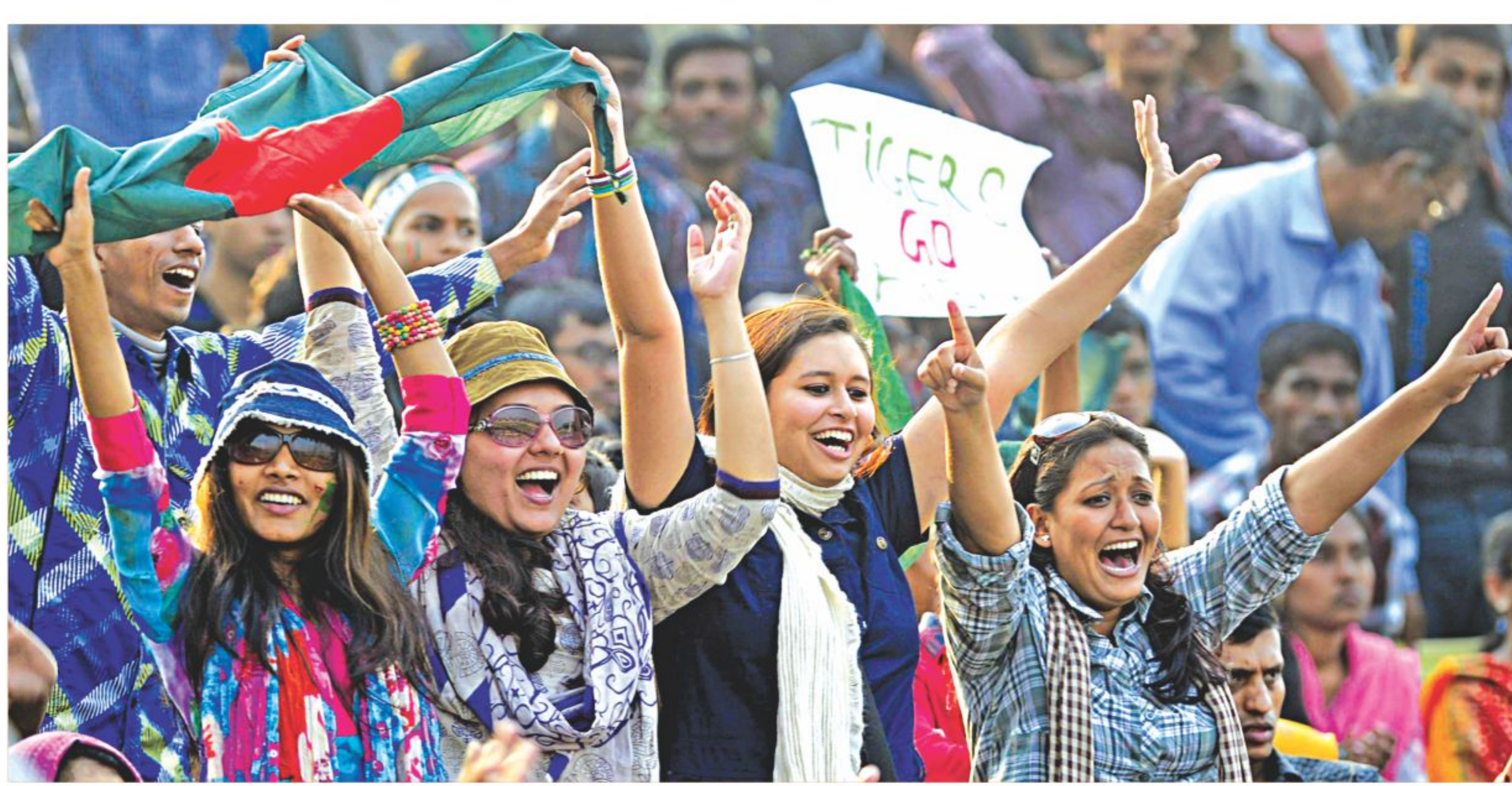
Spectators had a lot to shout about during Bangladesh's 7-wicket victory over West Indies in the first ODI at the Sheikh Abu Naser Stadium in Khulna yesterday.