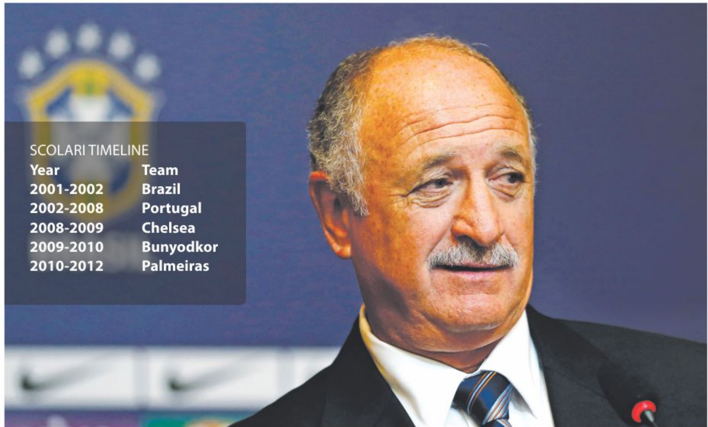
Newly-appointed Brazil coach Luiz Felipe Scolari reacts during his presentation in Rio de Janeiro yesterday.