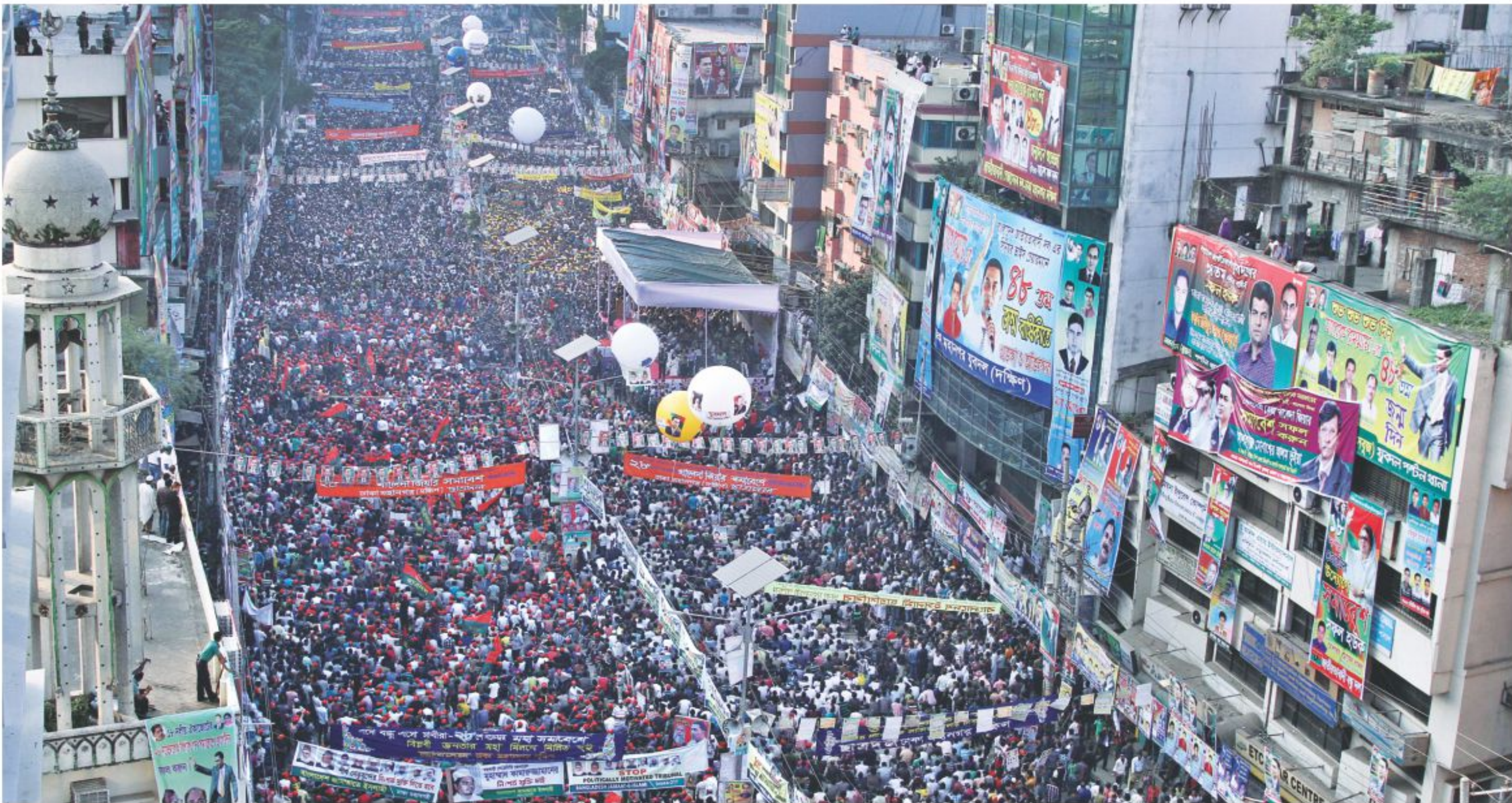
The BNP-led 18-party alliance holds a grand rally at the capital's Naya Paltan yesterday where thousands of opposition supporters gathered. Leader of the opposition and BNP chief Khaleda Zia addressed the rally.