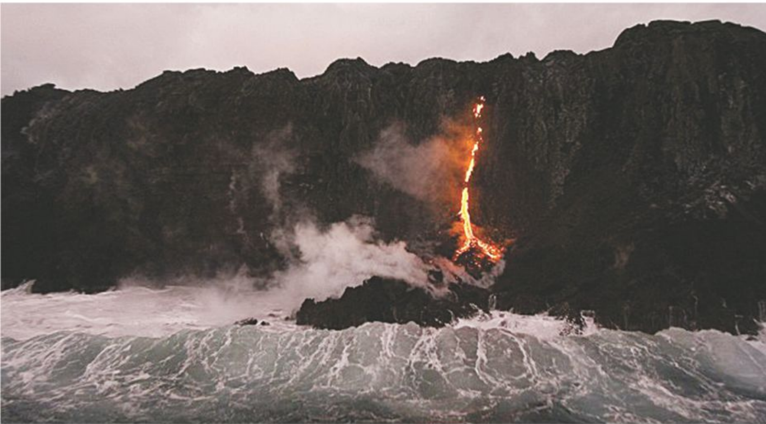
Lava from Kilauea Volcano in Hawaii flows into the Pacific creating a rare fusion of steam and waves that local tourism officials say could attract thrill-seeking visitors.