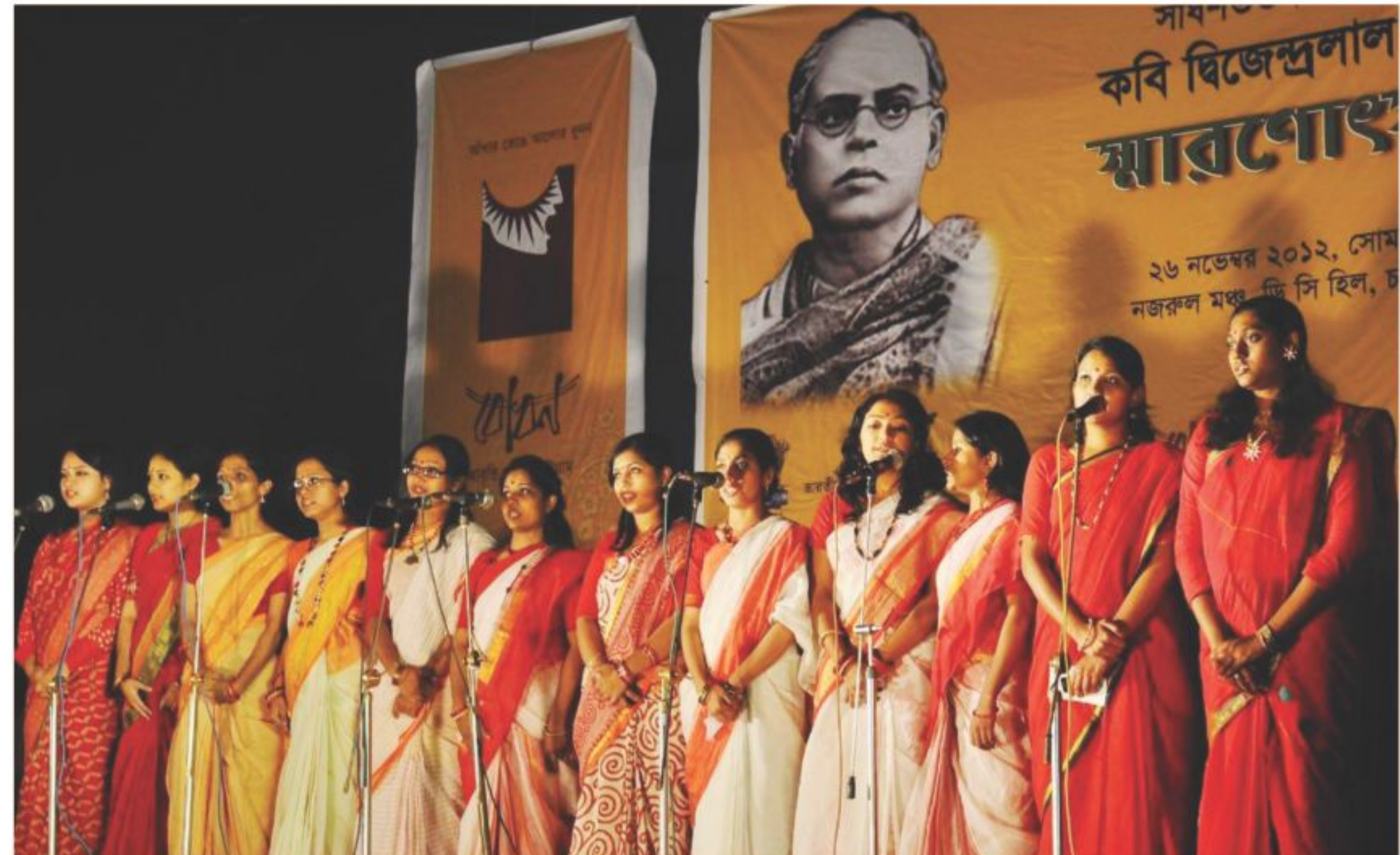
Members of Raktakarabi during a performance.