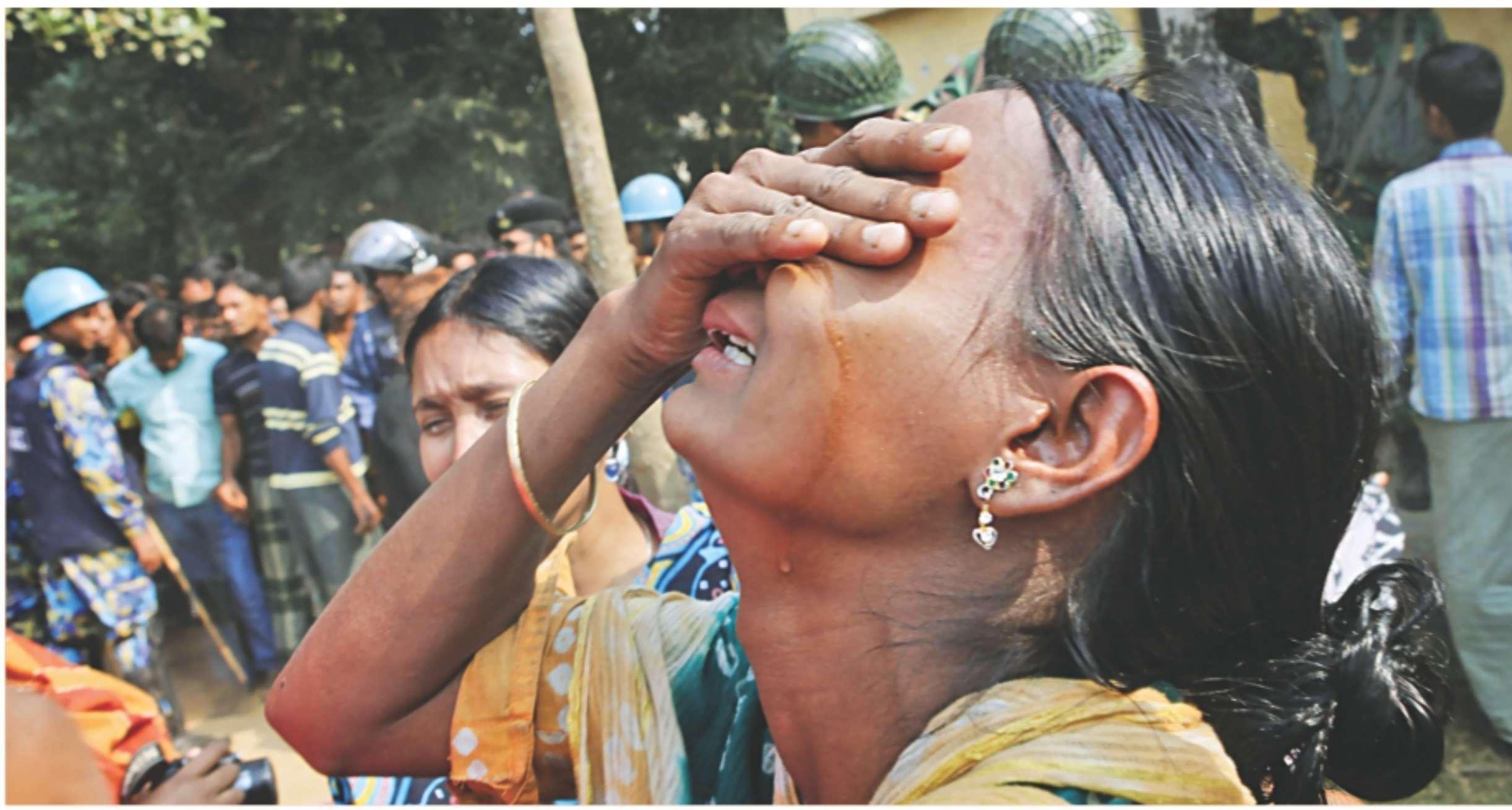
A woman cries her heart out at the sight of the body of a relative killed in the Nishchintapur tragedy. The photo was taken on Sunday at the playground of a local school where the bodies of Saturday's factory fire victims were being laid down.