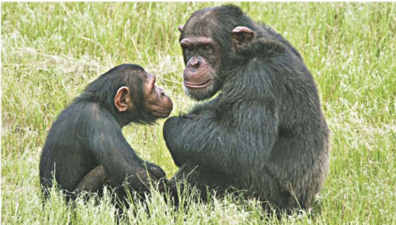
Chimps and orang-utans too experience mid-life crises suggesting that the society is not to be blamed for the problem some men face.