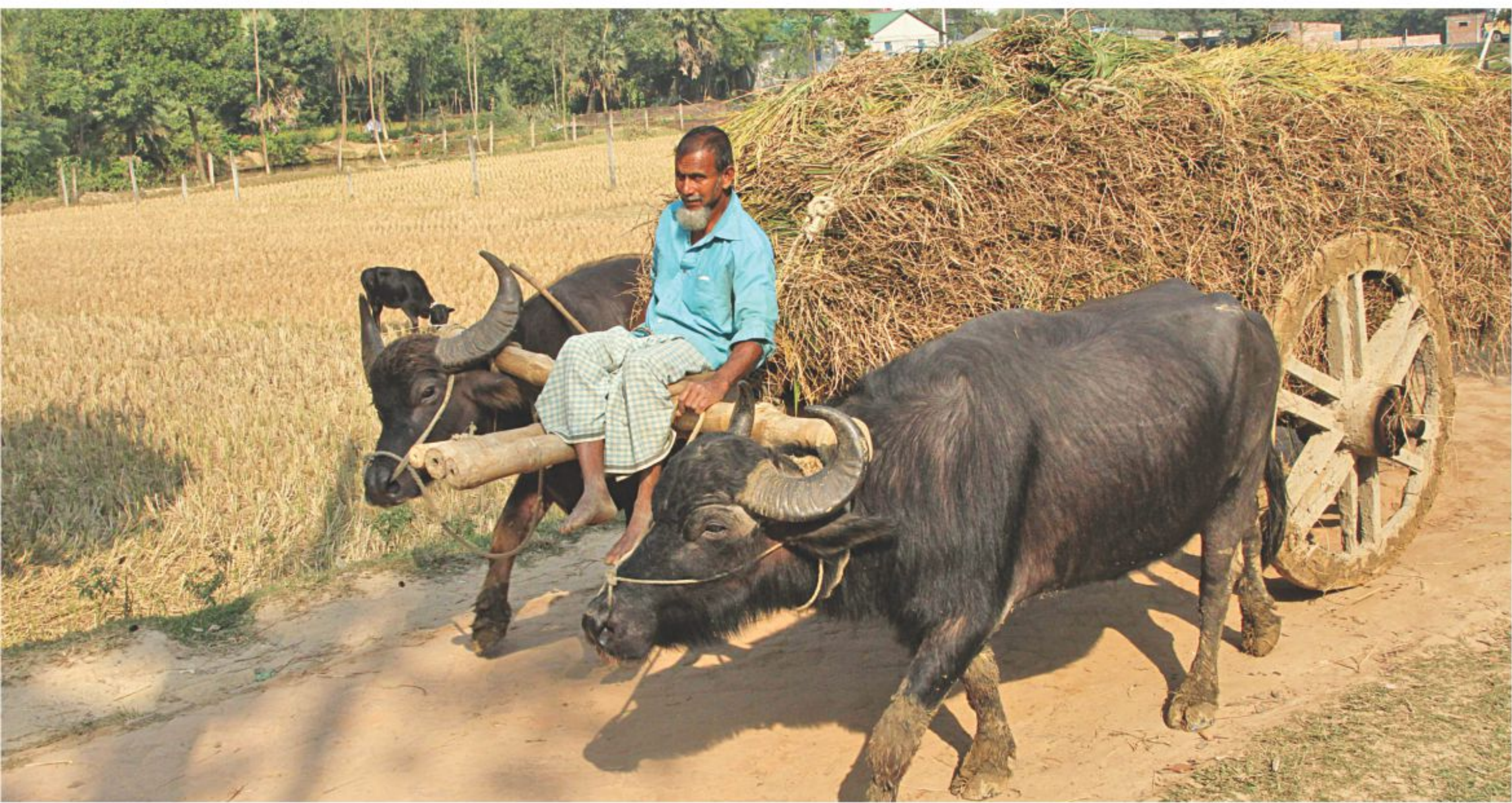
A farmer carries his produce on a traditional bullock cart on the dirt road of Shalna in Gazipur yesterday. Farmers across the country are now busy harvesting their aman paddy leaving fields empty, much like the one seen in the background of the photo.