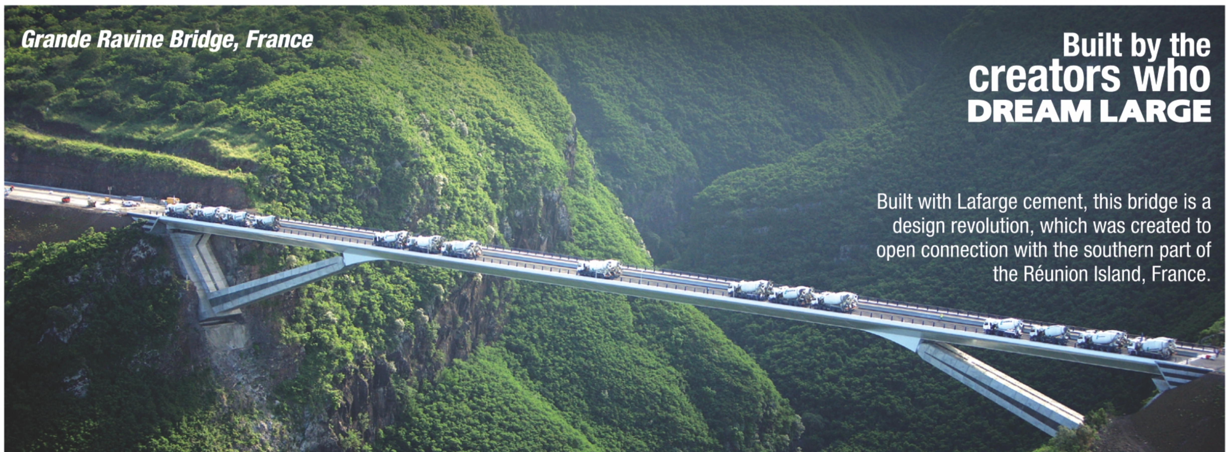
Grande Ravine Bridge, France

However, unless the ACC upgrades its inquiry into an investigation, the loaning process might remain stalled.