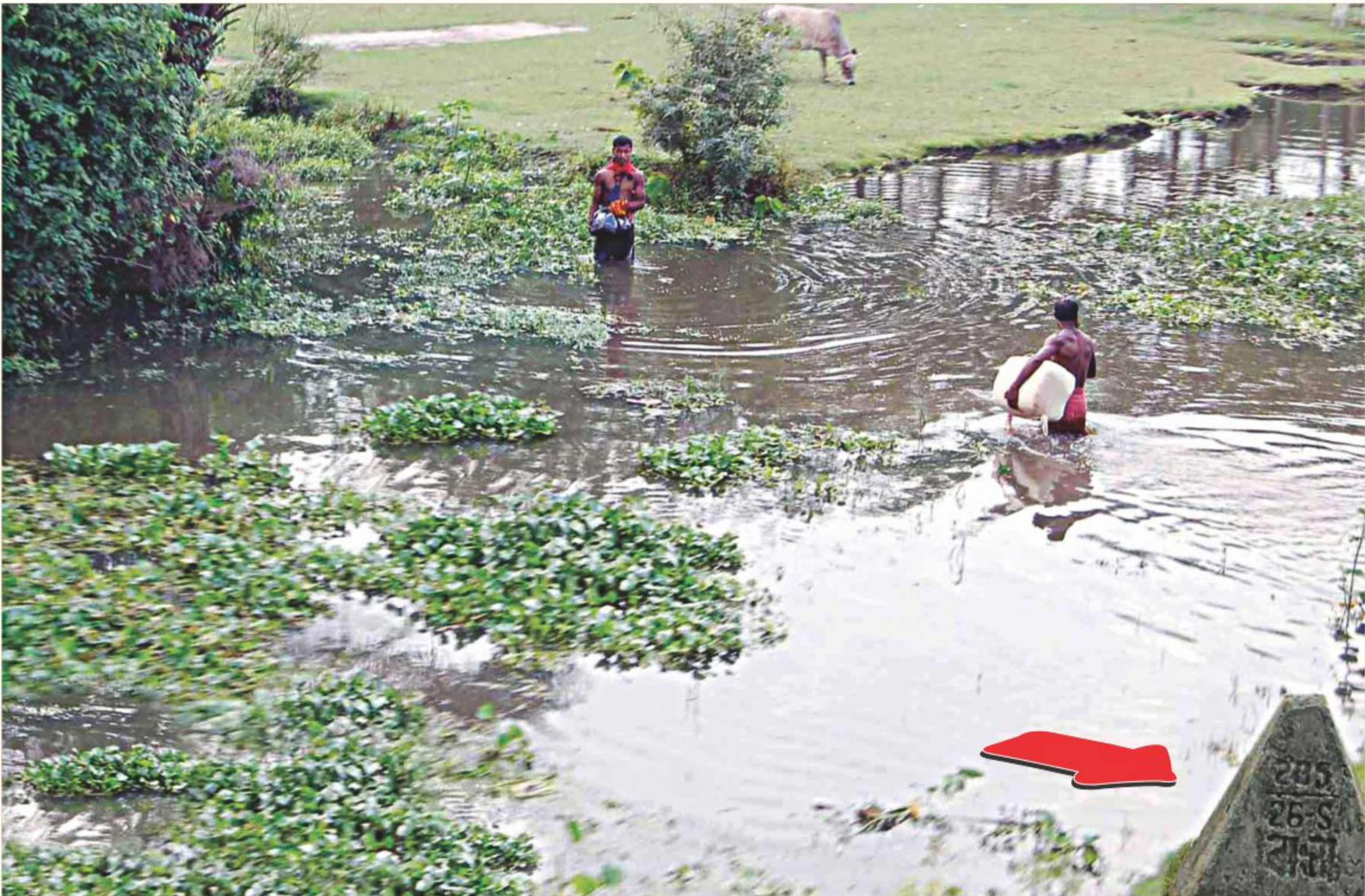
This shallow canal divides Bangladesh and India, the far side, and smugglers are seen yesterday carrying goods across the border at Hakimpur upazila of Dinajpur.