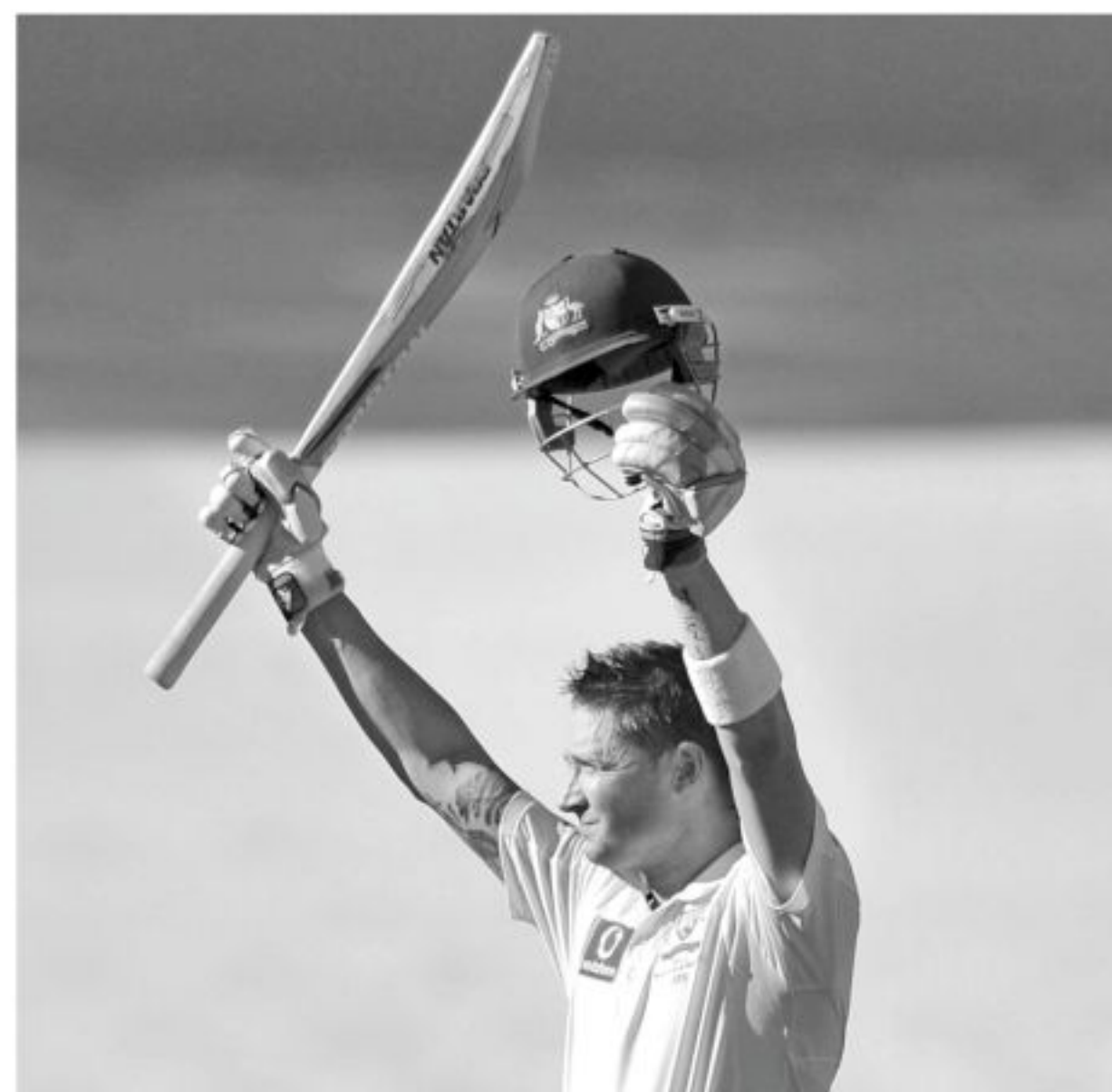
Australia skipper Michael Clarke celebrates his 200 runs against South Africa on the first day of the second Test at the Adelaide Oval yesterday.

At the close he was unconquered on 224. Hussey was bowled by Dale Steyn in the final over for 103 after raising his 18th century with a six off spirited legspinner Imran Tahir. South Africa looked far from the world's best team as their bowlers were hammered, after having the home side in trouble at 55 for three in the