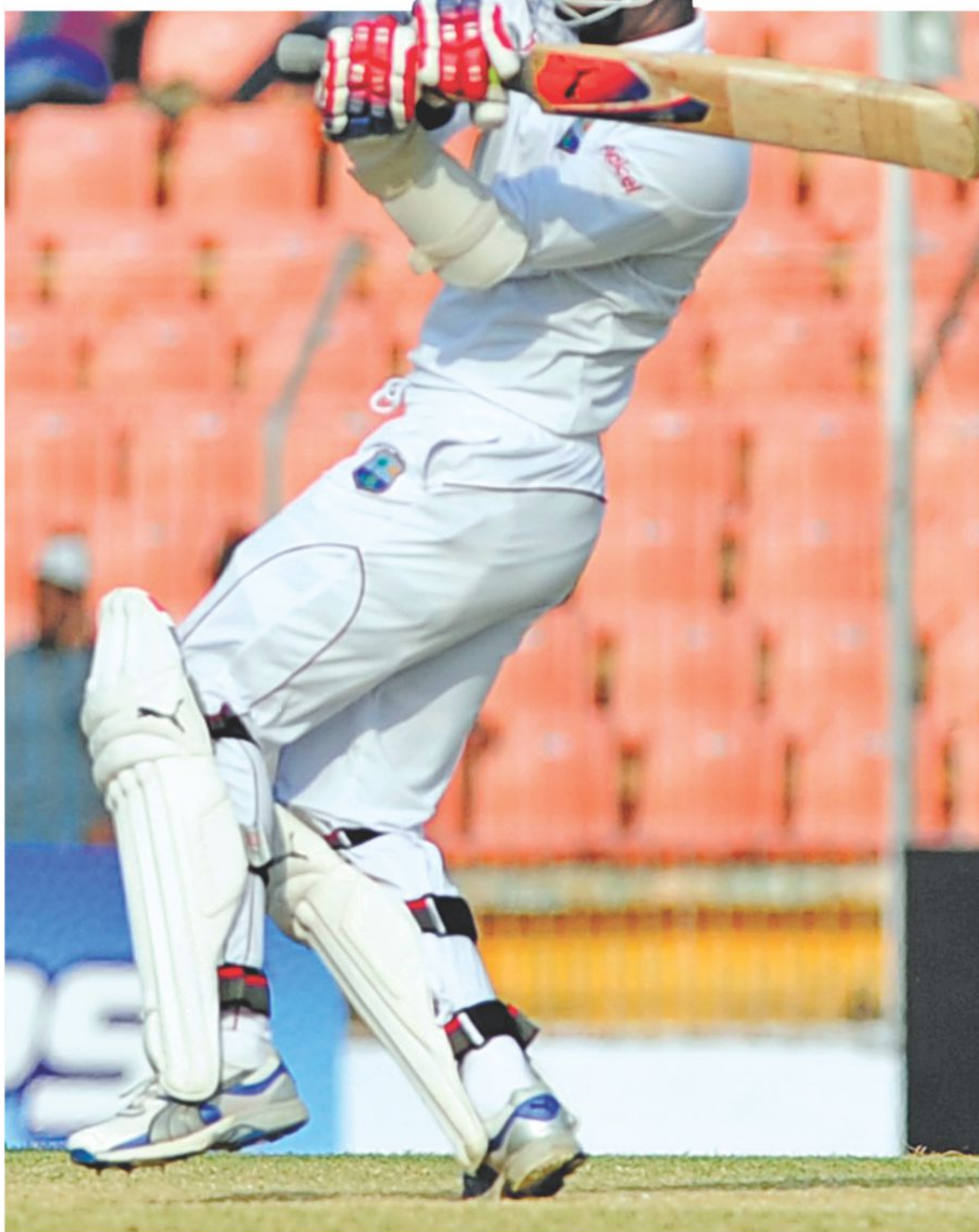
West Indies batsman Marlon Samuels plays a hook during his unbeaten 109 on the second day of the second Test against Bangladesh at the Sheikh Abu Naser Stadium in Khulna yesterday.