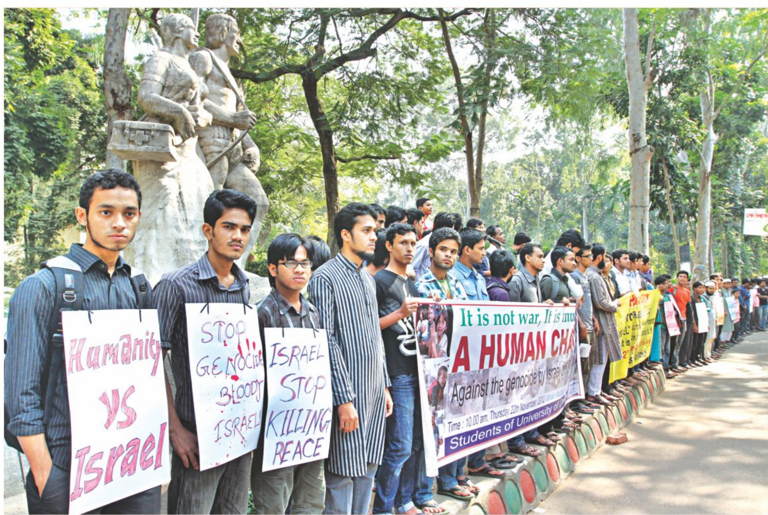
Students of Dhaka University form a human chain at Aparajeyo Bangla on the campus yesterday condemning the recent Israeli attack on Gaza in Palestine.