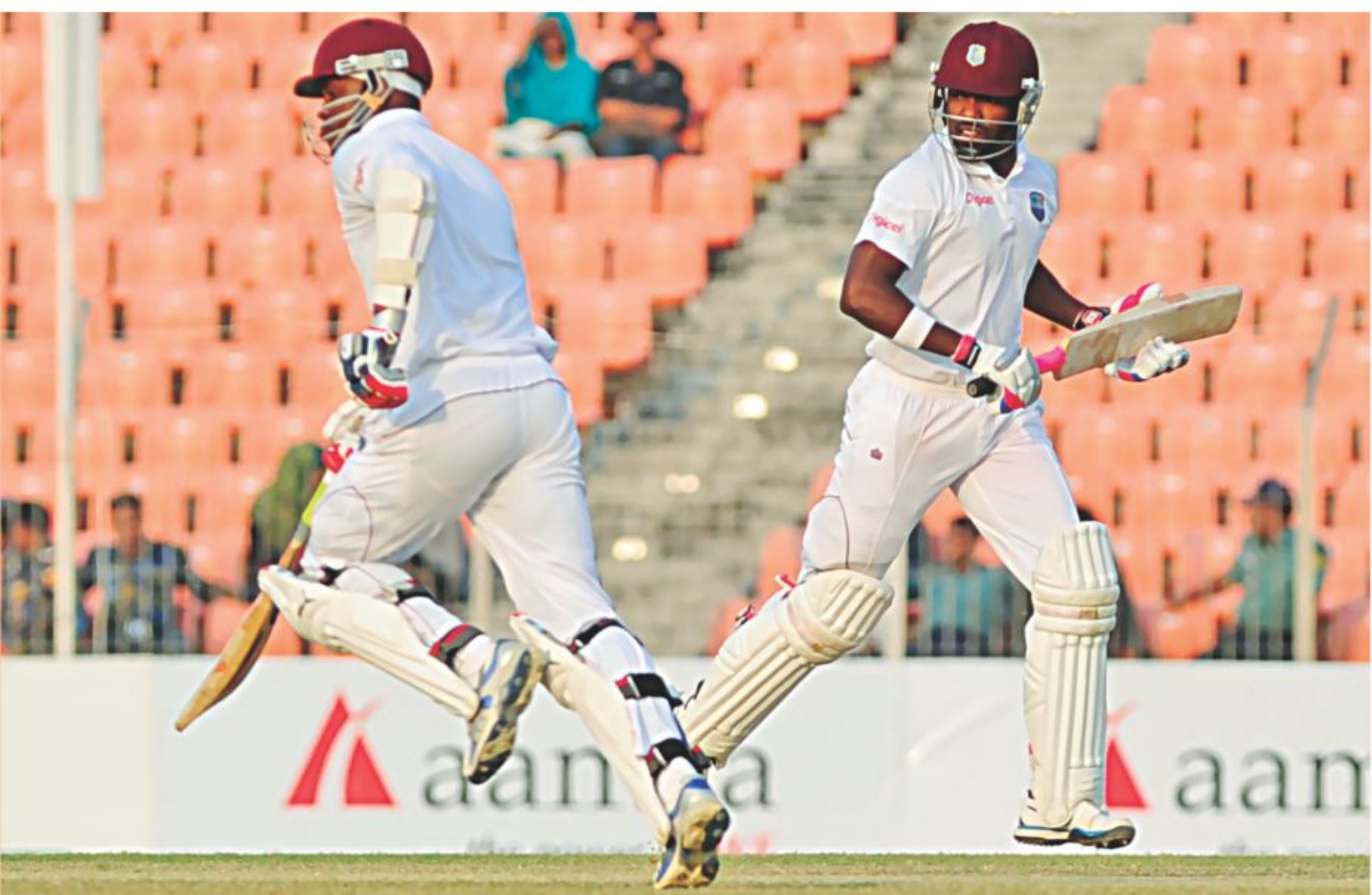
West Indies batsmen Marlon Samuels, left, and Darren Bravo congratulate each other during their unbeaten 198-run third-wicket partnership on the second day of the second Test against Bangladesh at the Sheikh Abu Naser Stadium in Khulna yesterday. The duo carried the visitors' score to 241 for two at stumps, trailing Bangladesh by 146 runs in the first innings. Story on page 16.