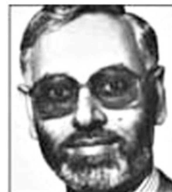
Lt Col Khandaker Abdur Rashid