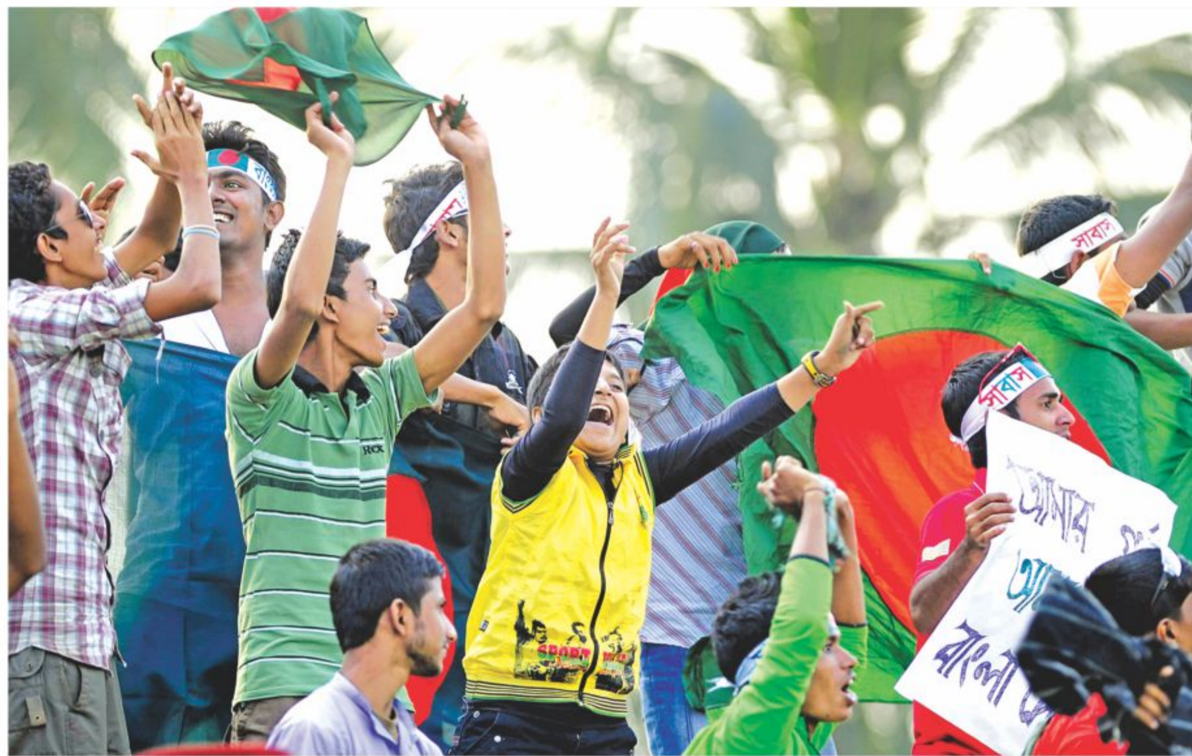
Colourful Khulna fans enjoy Bangladesh's batting against the West Indies on the first day of the second Test at the Sheikh Abu Naser Stadium yesterday.