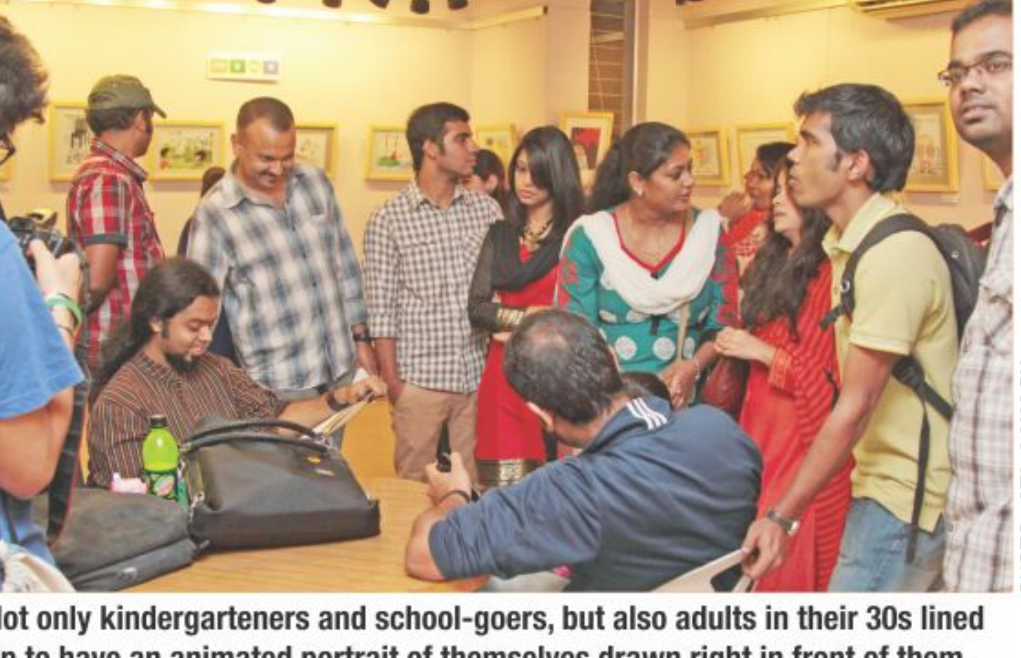
Not only kindergarteners and school-goers, but also adults in their 30s lined up to have an animated portrait of themselves drawn right in front of them.