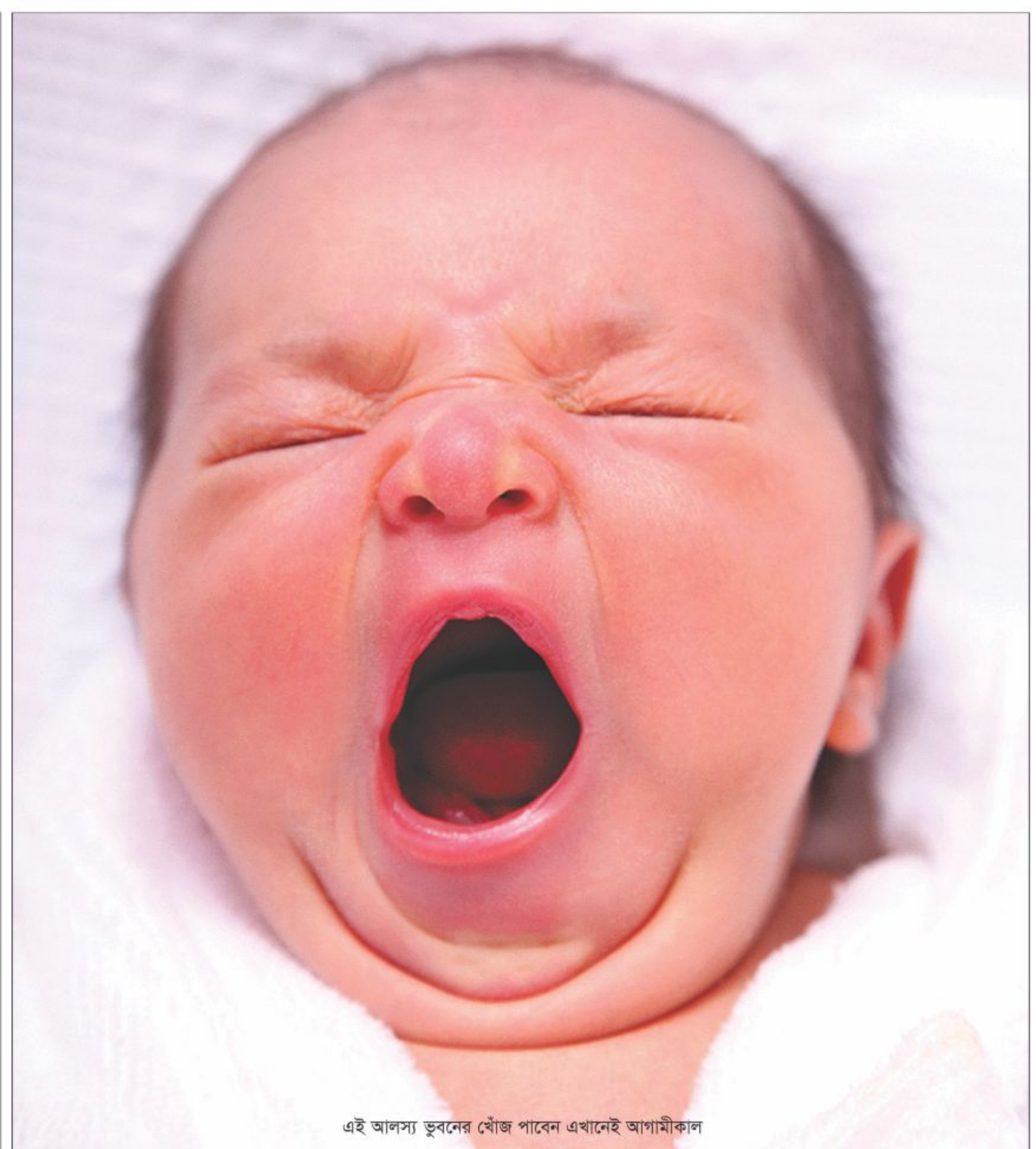
এই আলস্য ভুবনের যৌজ পাবেন এখানেই আগামীকাল