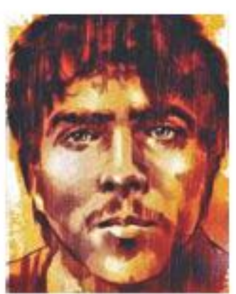
Ajmal Amir Kasab

Pakistani national Mohammed Ajmal Amir Kasab, one of the 10 attackers of 2008 Mumbai mayhem that killed 166 people, was hanged yesterday at a highly secured Indian jail.