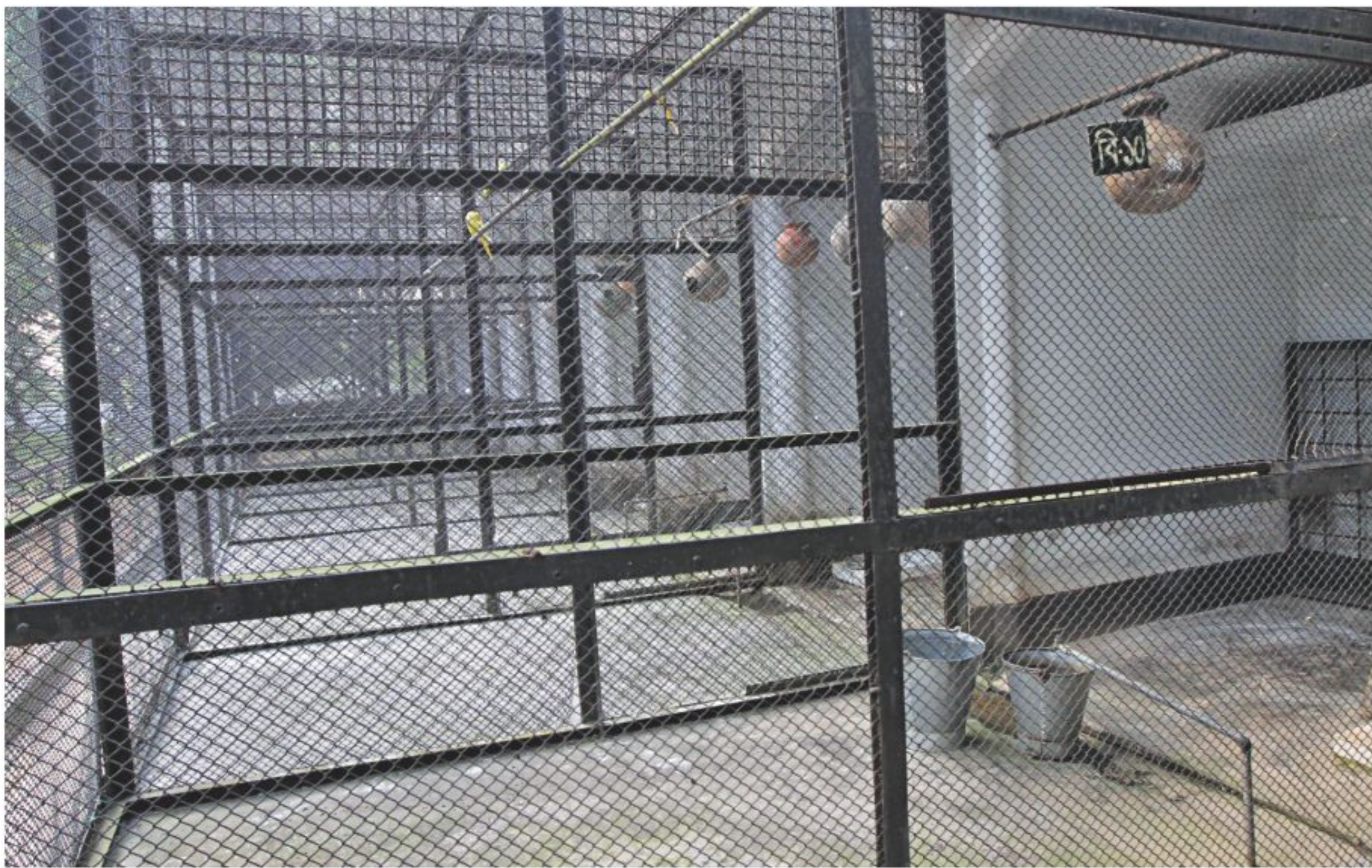
Eleven birds were stolen from aviary B-10 at Dhaka Zoo early Monday. The birds were of three species and worth around Tk 4.25 lakh.

Khar has claimed no such condition had been placed when she visited Dhaka to invite Hasina on November 9, the Indian