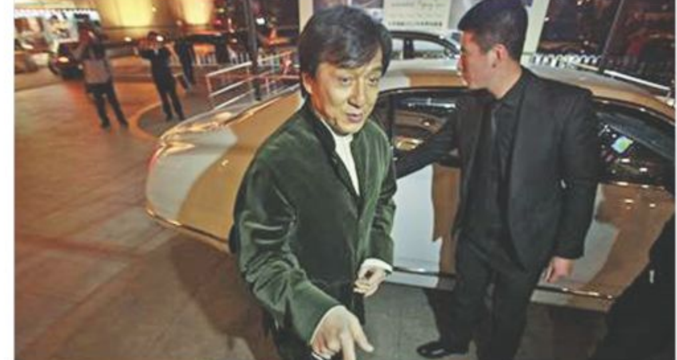
Jackie Chan gestures in front of a car before having his Bentley 666 auctioned for charity in Beijing.