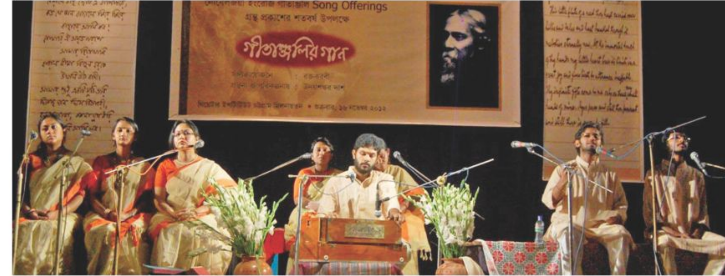
Members of Raktakarabi sing at the programme.