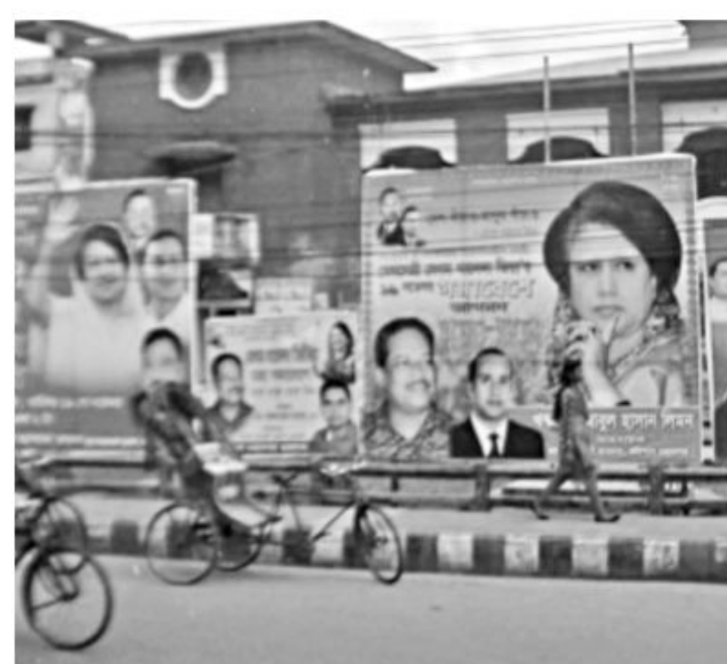
Large hoardings cover the frontal view of Barisal Ashwini Kumar Hall at the heart of the city, and right, a main thoroughfare of the city gets 'decorated' with colourful lightings, banners and posters as BNP activists have made grand arrangements to welcome party Chairperson Khaleda Zia this evening.