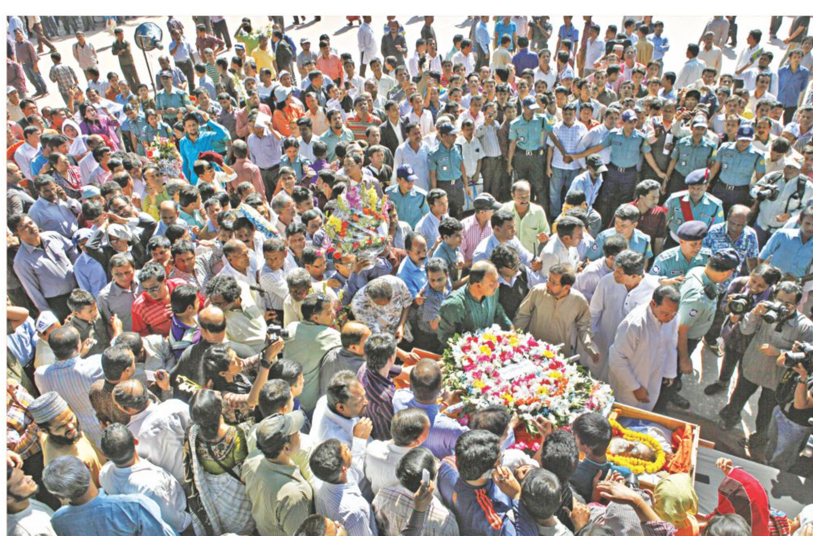
People throng Central Shaheed Minar in the capital to pay last respects to Subhash Dutta, an iconic figure of Bangla film, yesterday.