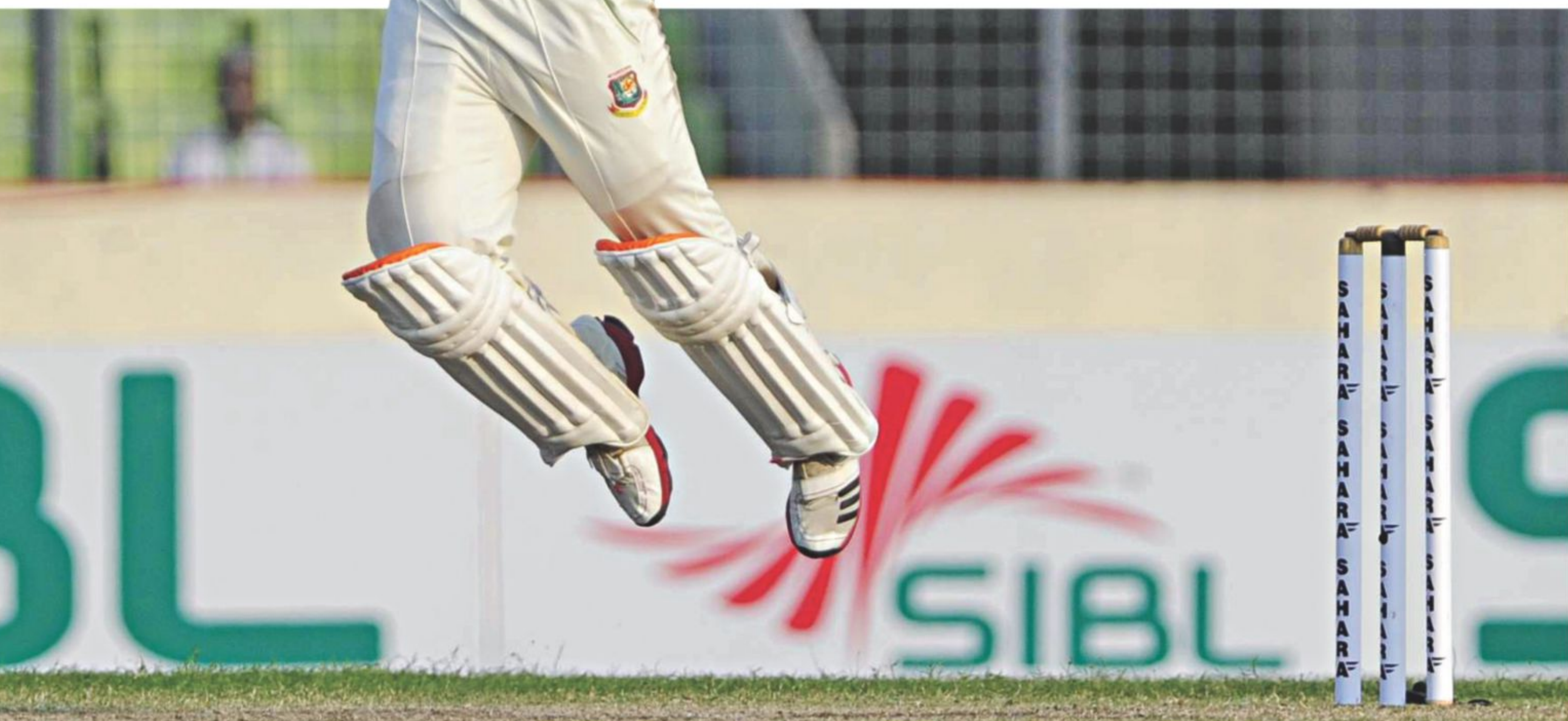
Bangladesh opener Tamim Iqbal is airborne and off-balance while trying to clobber a short and wide ball from West Indies captain Darren Sammy, only managing to hit it to mid-on to bring an end to his 71-ball 72 on the second day of the first Test at the Sher-e-Bangla National Stadium in Mirpur yesterday.