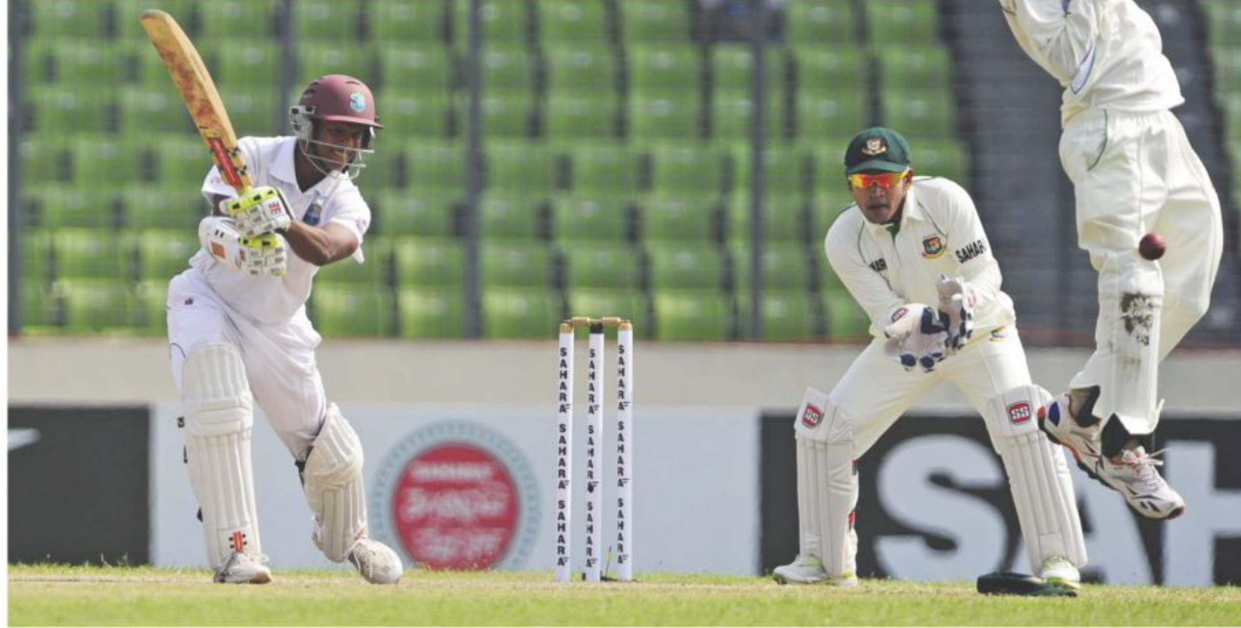
West Indies batting great Shivnarine Chanderpaul has Bangladesh's silly point fielder on the hop as he laces a cover drive for four during his unbeaten 203 on the second day of the first Test at the Sher-e-Bangla National Stadium in Mirpur yesterday.